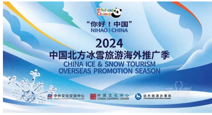
Xinjiang, Liaoning and Heilongjiang Overseas promotion week will include theme videos, exhibitions focusing on unique ice and snow resources and

In this Ice and Snow promotional season China's national tourist image, together with the ice and snow cultural riches of each area, are promoted through many carefully selected series of videos, documentaries, virtual exhibitions and photography exhibitions.