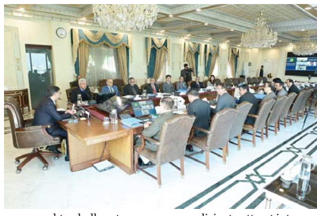
concerned to chalk out necessary policies to attract interna-

In a bid to promote and develop IT sector in the country, he directed the authorities