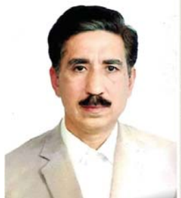
considerations. Purpose and message all across the board is clear and loud that we mean business on merit. Chairman using his discretionary powers under Section of MTI Act 2015.

Probably first ever appointment purely on merit and for sake of Allah, no ethnic, tribal linguistics