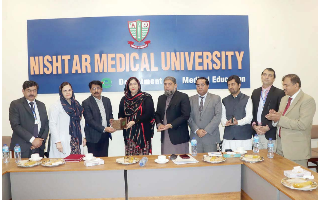
facilities, development projects and ongoing educational and teaching activities in Nishtar Medical University and Hospital and also thanked the Nishtar administration for their hospitality.

The members expressed their satisfaction over the provision of medical