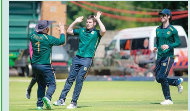
Sports Desk LAHORE: Josh Little claimed a national-record six wickets for 36 and Curtis Campher hit a brisk 66 as Ireland beat Zimbabwe by four wickets on Friday to take a 1-0 lead in the ODI series.