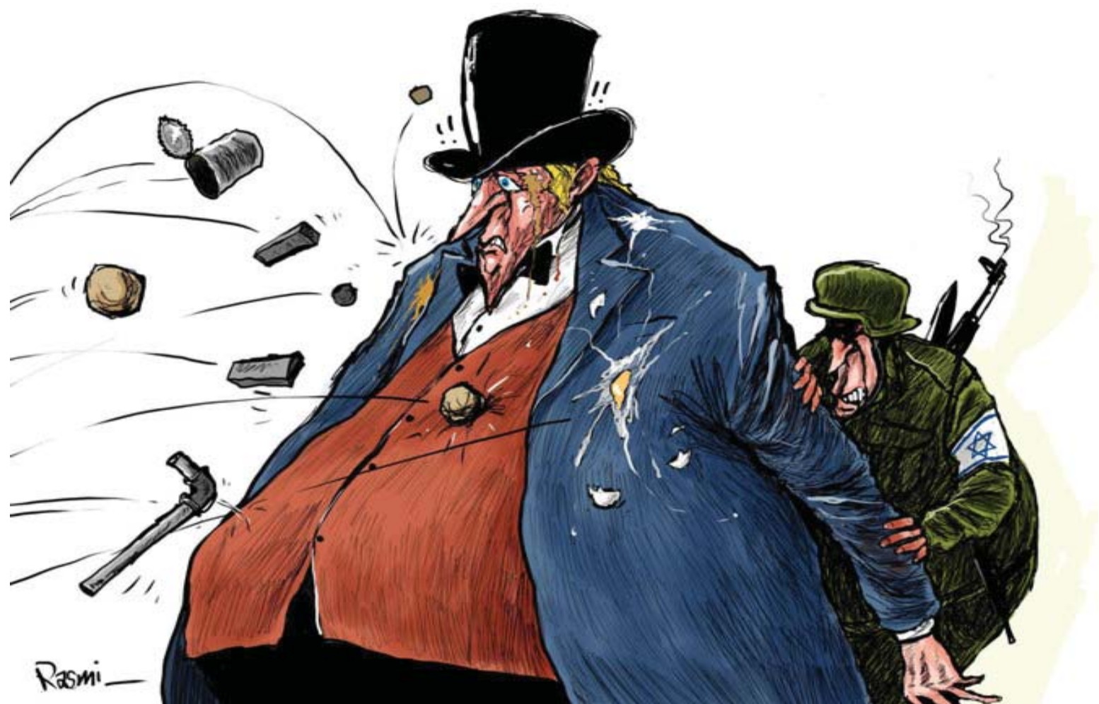
Cartoon by Amjad Rasmi. (Courtesy of Ashraf Al-Awsat)