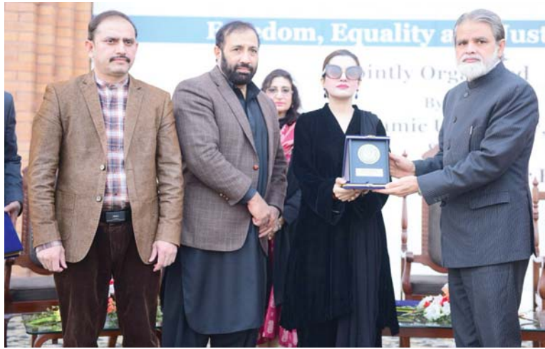
International Human Rights Day stands as a global reminder of the fundamental principles that uphold human dignity, equality, and justice. She emphasized the importance

of utilizing this day as an opportunity for individuals, communities, and nations to reflect on the strides made in safeguarding human rights and to address persisting challenges. She called for collective action to protect and promote the rights and freedoms of every individual, regardless of race, gender, religion, or nationality.