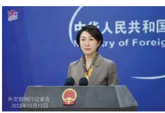
tional Press Center (IPC).

"On Kashmir issue, China's position is consistent and clear. This is a dispute left from the past between India and Pakistan and it should be properly addressed in peaceful means according to UN charter, UNSC resolutions and relevant bilateral agreements," Chinese Foreign Ministry's Spokesperson, Mao Ning said during her regular briefing held at Interna-