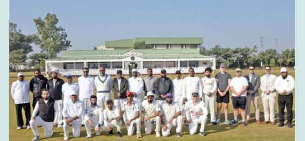
ISLAMABAD: Players are posing for a group photo graph after "Friendship Through Sports" match Oval Cricket Ground in Federal Capital.