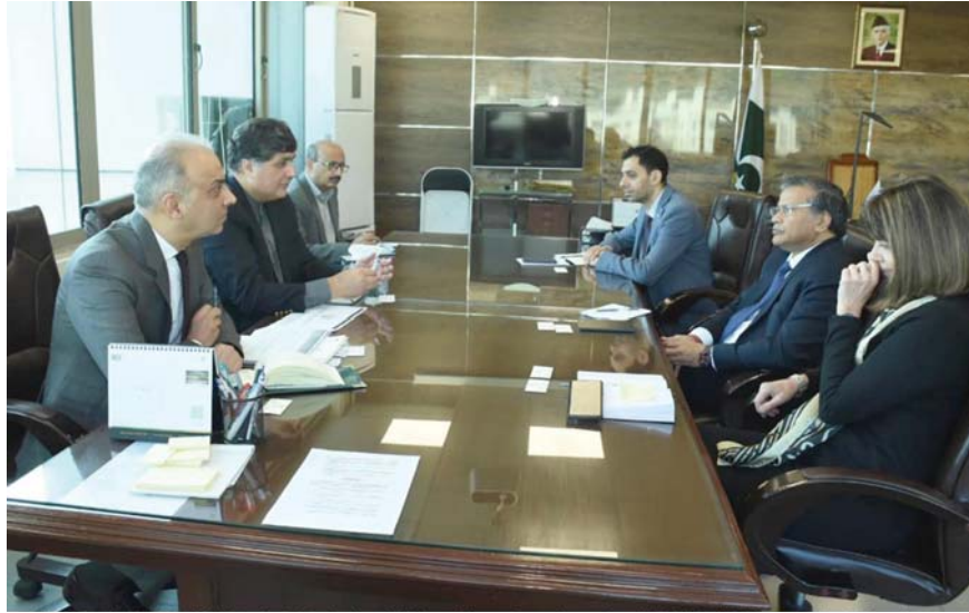
explore the options for cooperation and the capacity building of Privatisation Commission.

The minister also shared recent developments in the privatization process of PIACL and Roosevelt Hotel. The delegation was told that PIACL will undergo restructuring thereby improving its appeal for prospective buyers in the aviation industry. The privatization of PIACL will bolster the aviation business in the country which will require some regulatory framework from the government. Possibilities of cooperation with British High Commission in developing regulatory framework for aviation industry and for privatisation in general were also discussed. It was agreed to further