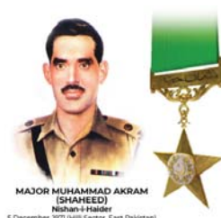
MAJOR MUHAMMAD AKRAM SHAHEED (Nishan-e-Haider) 5 December 1971 (Gawadar, East Pakistan)

RAWALPINDI: Armed Forces of Pakistan, CJCsSC & Services Chiefs pay glowing tribute to Major Muhammad Akram Shaheed, Nishan-e-Haider on his 52nd Shahadat Anniversary today.