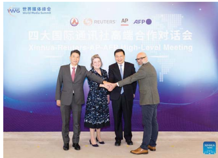
AFP Executive Committee and AFP Asia-Pacific regional director, said while AI can help media outlets boost productivity, "we believe it is also very