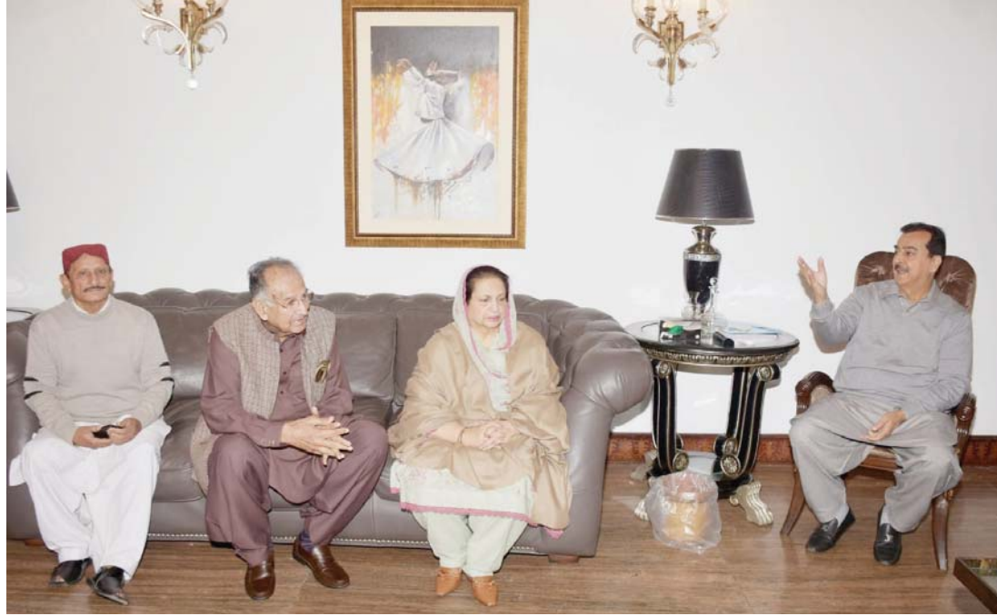
February 8, the women of Pakistan People's Party will play their full role to make the party candidates successful and, God willing, Bilawal Bhutto Zardari will be the next prime minister of Pakistan.

On this occasion, Begum Belam Hasnain Kharal said that in the general elections that are being held on