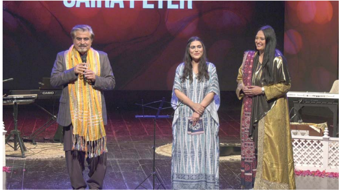
drama based on the story of Umar Marvi, one of Latif's "seven heroines" of Sindh.

She is currently working with a team of British artists to develop the world's first full-scale "Sufi Opera", a musical stage