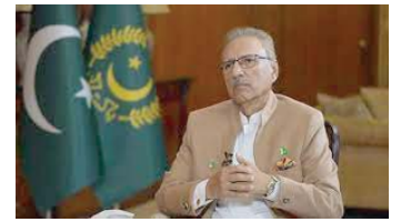
figure. Pakistan remains committed to its mission to eliminate societal barriers that obstruct their journey to success. Our goal is to facilitate them to achieve their utmost potential through equitable access to opportunities in life," a press release of President Secretariat Press Wing quoted the president as saying.

The president said that they commemorated a day dedicated to honouring the inherent dignity and impactful contributions of Persons with Disabilities (PWDs). The United Nations' theme for this year's International Day of Persons with Disabilities, "United in Action to Rescue and Achieve the SDGs For, With, and By Persons with Disabilities," advocated for dedicating ourselves to building an inclusive society," he added. On the day, they acknowledged the exceptional strength and unwavering resilience of persons with disabilities who had progressed in life despite their disability, he added. The president opined that almost 15% of the world's population suffered from some form of disability. "Unfortunately, 80% of its population lives in developing countries, including Pakistan, where the population of PWDs is estimated to be almost 12%, an alarming