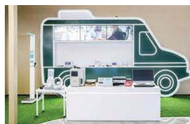
convenient medical treatment, the tracing system will guarantee

"With the help of modern technology, traditional medicine will become more 'intelligent' While experiencing an efficient and