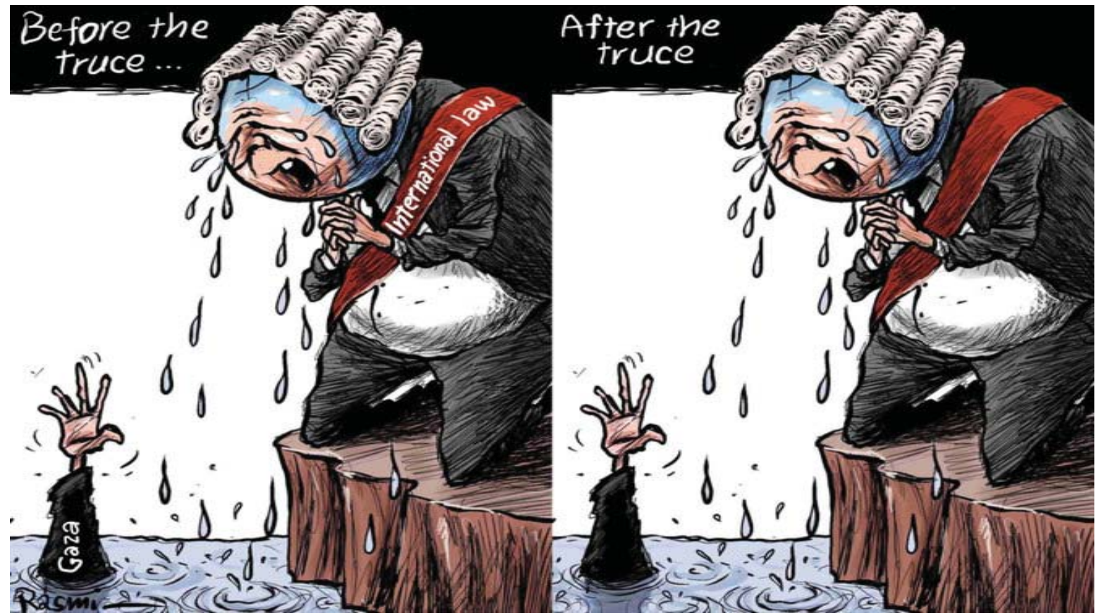
Cartoon by Amjad Rasmī.