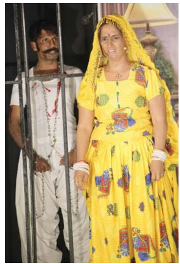
Essani, a noted stage and television

The true son of soil kept braving all agonies instead of surrendering to the intruders and was hanged to death by the British Government near Nagarparkar on 22 August 1858. Raffique