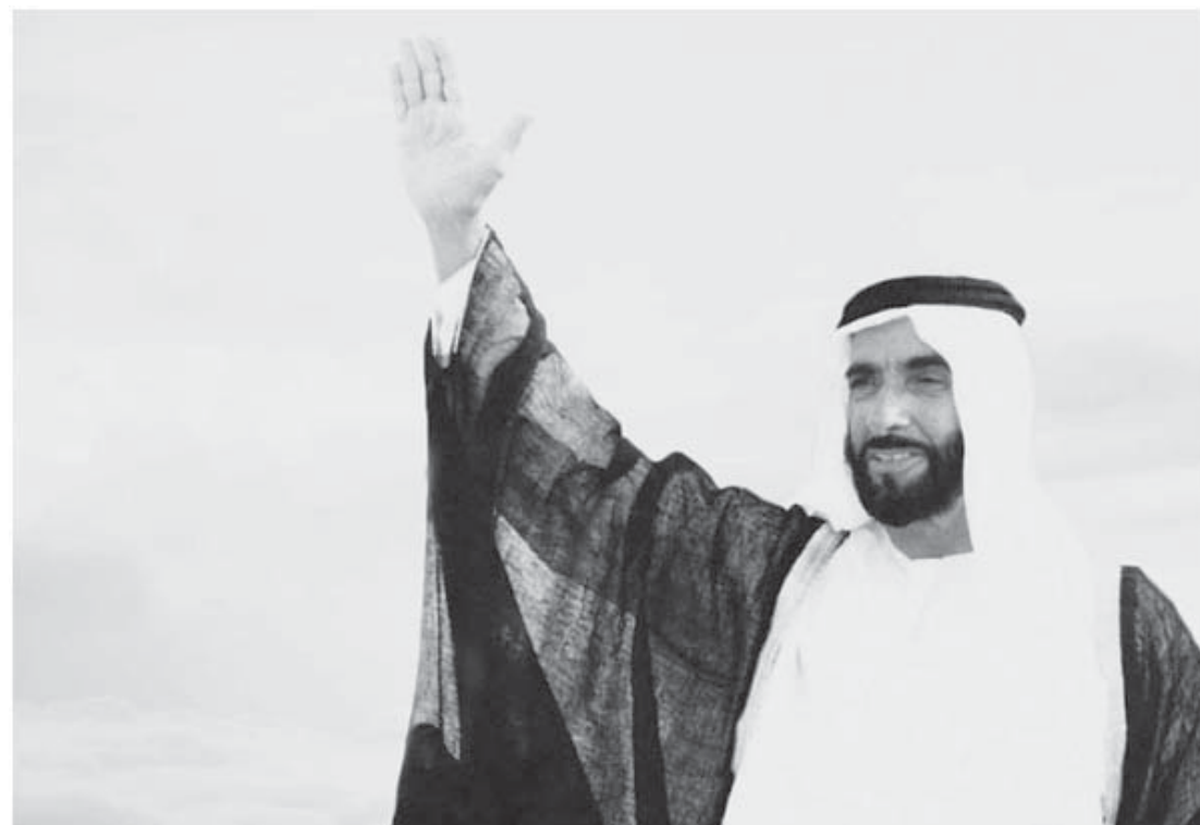
Sheikh Zayed bin Sultan Al Nahyan