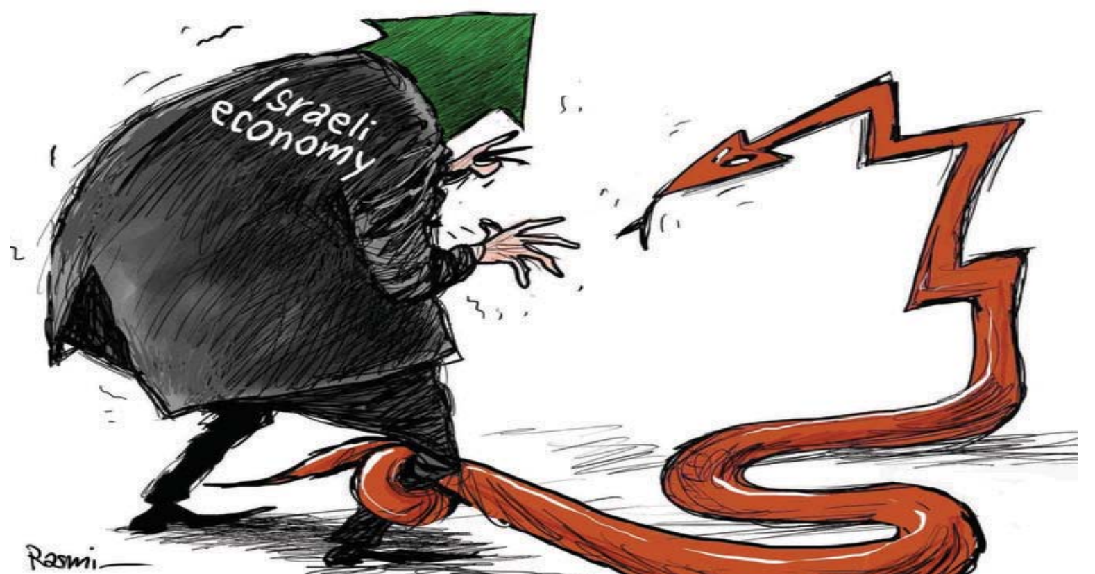
Cartoon by Amjad Rasmī. (Courtesy of Ashraf Al-Awcat)

Working to enhance climate resilience, the nation is addressing vulnerabilities for a resilient future.