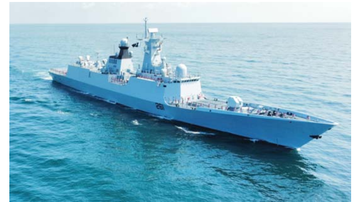
File Photo of PNS Tughril