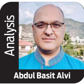
Analysis Abdul Basit Alvi

The persistent violence instigated by the BLA has severe implications for the development and stability of Balochistan, hindering economic progress and raising security concerns, especially regarding infrastructure projects like the China-Pakistan Economic Corridor (CPEC). The Pakistani government has responded to the insurgency through a combination of military operations and attempts at political reconciliation. However, finding a sustainable solution remains a formidable challenge.