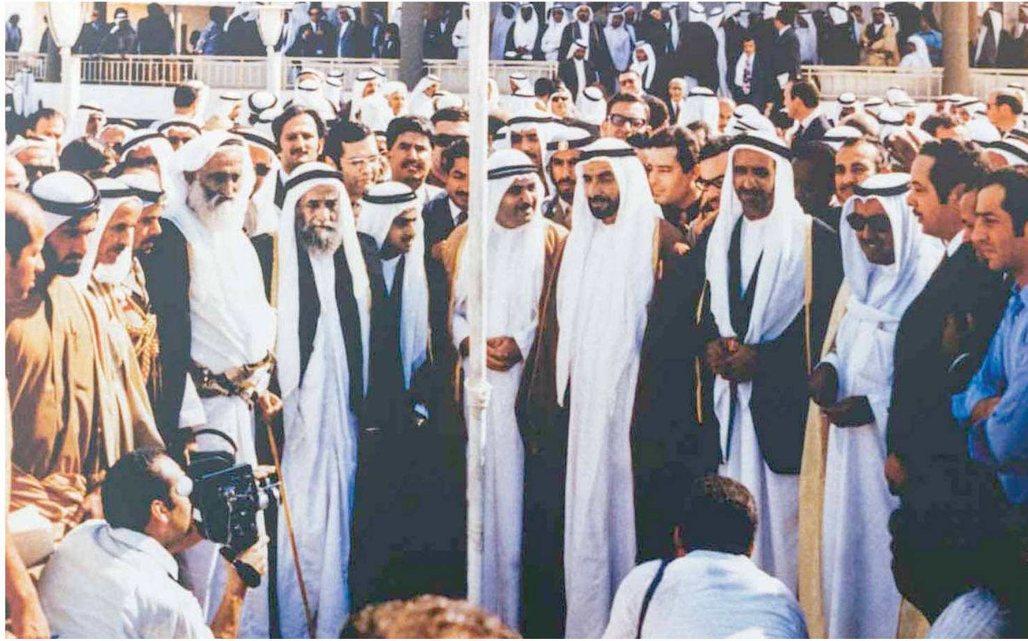
Sheikh Zayed bin Sultan Al Nahyan, the first president of the UAE, played a pivotal role in leading the federation