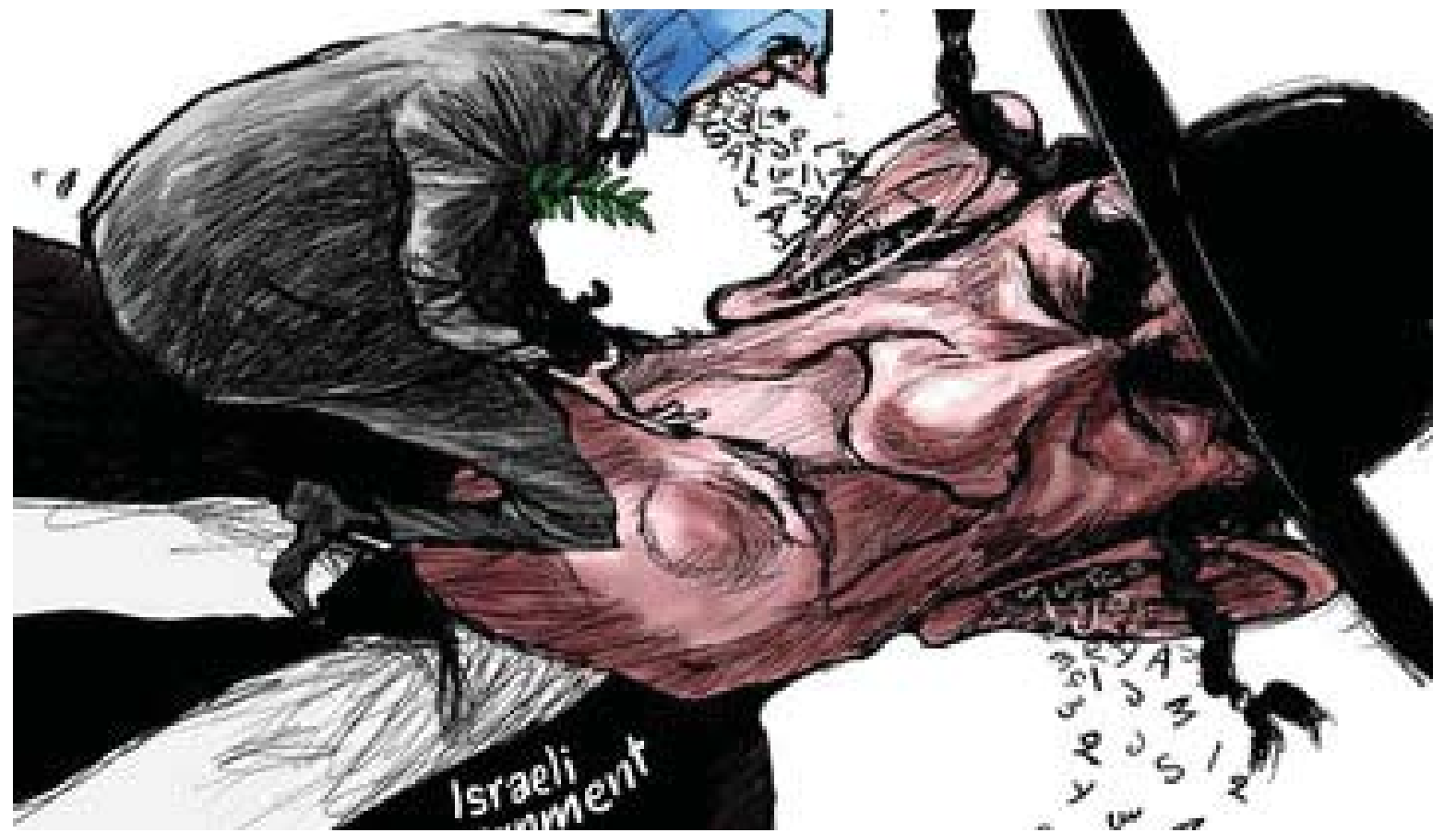
Cartoon by Amjad Rasmī.