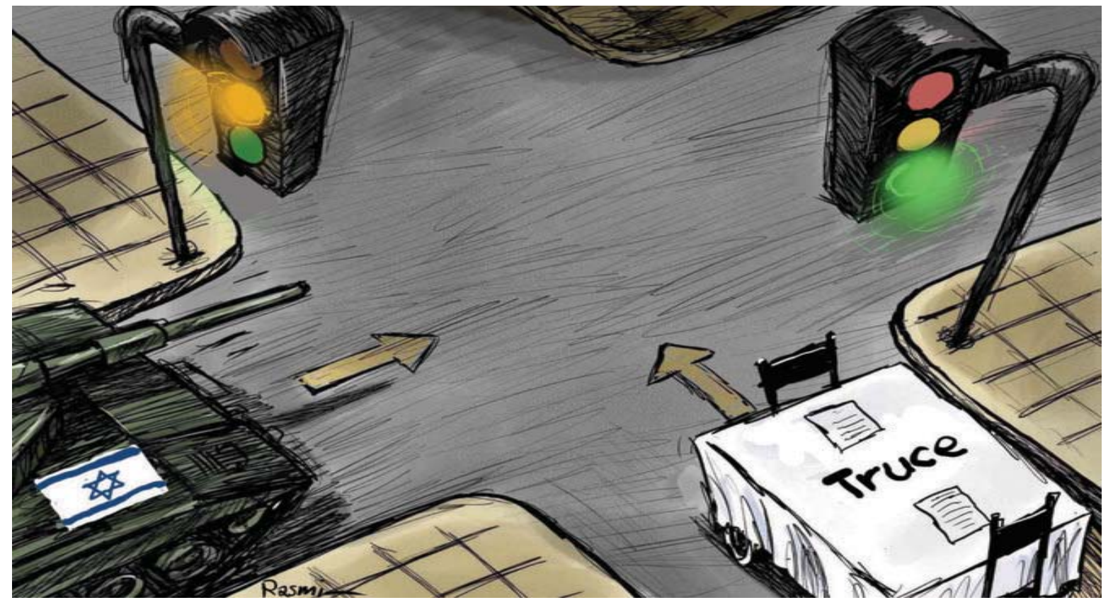
Cartoon by Amjad Rasmi. (Courtesy of Ashraf Al-Awzat)

As of the end of September, China's renewable energy installed capacity reached 1.484 billion kilowatts, exceeding the scale of coal power installed capacity, among which the installed capacity of solar power generation is approximately 540 million kilowatts, as well as the wind power generation is approximately 410 million kilowatts. When it comes to the hydrogen energy, the country's annual hydrogen production exceeds 35 million tons, making it the world's largest hydrogen producer. More than 300 hydrogen refueling stations have been built, signifying hydrogen fuel cell vehicles gradually enter the lives of ordinary people. In every sense, a stable industry chain has begun to take shape. "The total annual carbon dioxide emissions of the global logistics industry are 3.5 billion tons, of which the international shipping industry accounts for about 3 percent," Jens Eskelund, North Asia Chief Representative of Maersk, proposed, "we choose green methanol as a short- and medium-term solution to help us achieve our decarbonization goals."