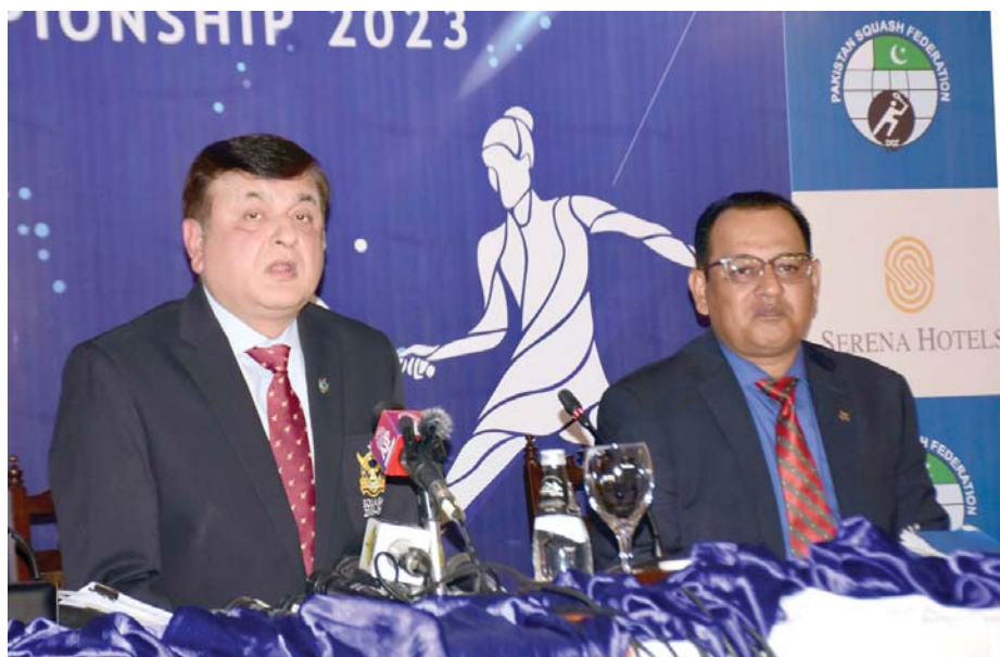
on 4th December 2023, while the opening ceremony is set for 29th November 2023. "The PSF has been working really hard to raise squash's image throughout the nation. The feder-