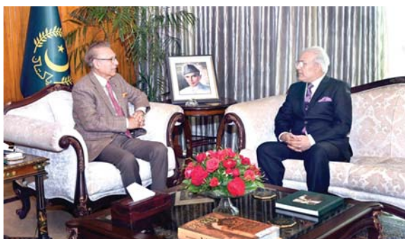
who called on him, at Aiwane-Sadr, President Secretariat Press Wing said in a press release.