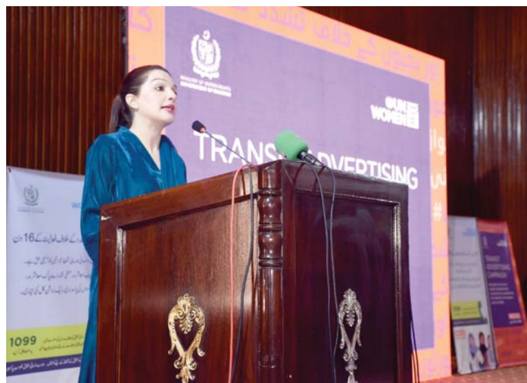
The Special Assistant to Prime Minister stressed the importance of collection