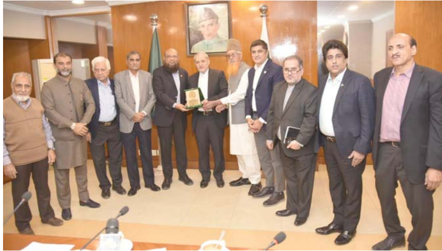
The two countries also enjoy cultural and religious bonds. He expressed his desire to