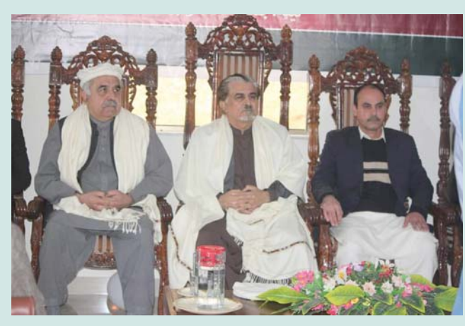
Federal Minister Jamal Shah inaugurates Department of Pashto

increase connectivity between industry and academia in view of contemporary challenges, discuss and find solutions to problems related to emerging technology and employment opportunities, e-commerce, scholarships, expensive education and industry demand.