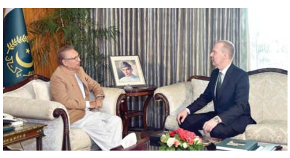
economy for the mutual benefit

ISLAMABAD: President Dr Arif Alvi has reiterated Pakistan's desire to forge a longterm, multi-dimensional partnership with Russia in all fields, including trade, economy, food security, energy, defence and people-to-people contacts. He mphasized the need to increase bilateral trade and economic ties, adding that there existed enormous potential for the growth and expansion of cooperation in the areas of trade and