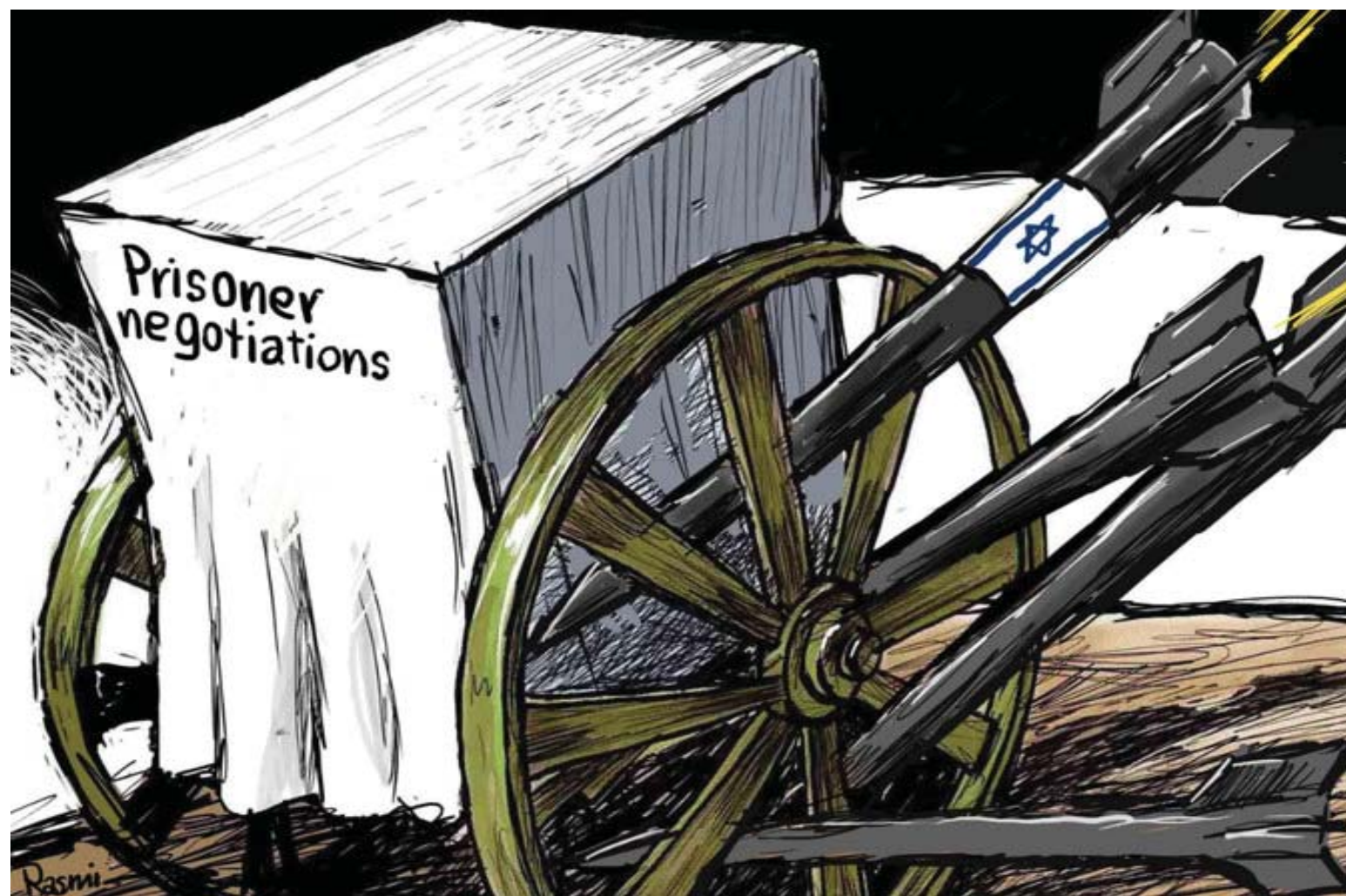
Cartoon by Amjad Rasmi.