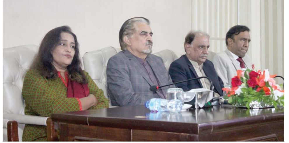
and western music. This was said during an event "Globalization and Pakistani Culture" organized by an NGO "Alliance" in coordination with information services academy.

The variety of Pakistani Music ranges from diverse provincial folk music and traditional styles such as Qawali and Ghazal Gayki to modern forms of traditional