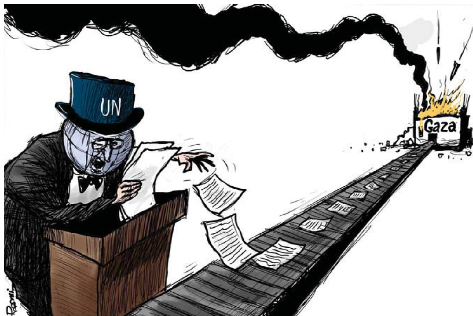
Cartoon by Amjad Rasmi.