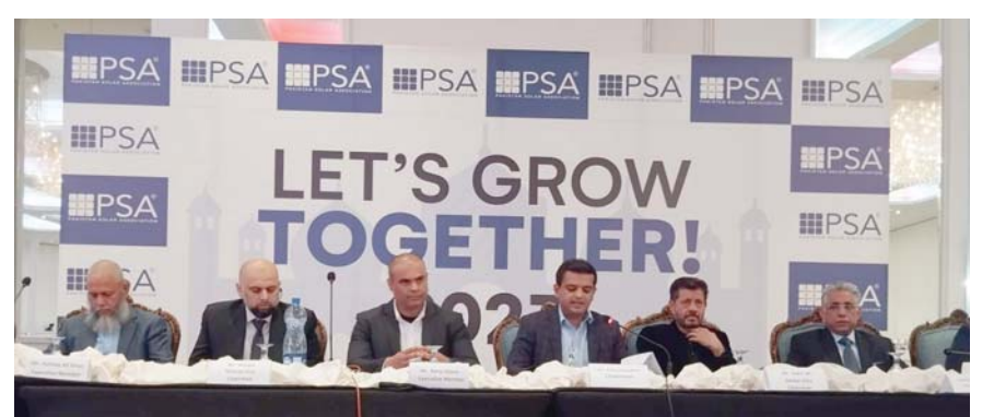
future, fostering economic growth and job creation along the way.

PSA is confident that by working closely with the government and local stakeholders, the solar industry will play a pivotal role in propelling Pakistan toward a sustainable, clean energy