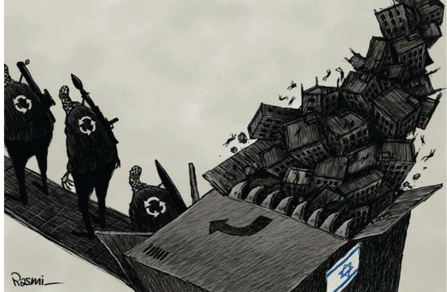
Cartoon by Amjad Rasmi.