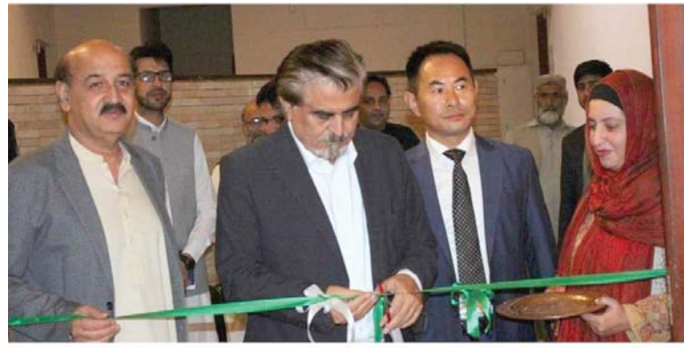
and depth of Chinese contemporary art. The event was a celebration of artistic excellence and cultural harmony, reinforcing the bond between Pakistan and

together a curated selection of works by prominent Chinese contemporary artists, highlighting the rich artistic traditions and innovative approaches of Chinese art. The exhibition serves as a commemoration of the 10th anniversary of the China-Pakistan Economic Corridor (CPEC) Belt and Road Project, symbolizing the cultural exchange and artistic collaboration between the two nations. The exhibition consists of a diverse array of artworks, including intricately crafted scrolls, awe-inspiring sculptures, and mixed-media creations that blend tradition with modernity. Each piece tells a unique story, inviting viewers to immerse themselves in the beauty