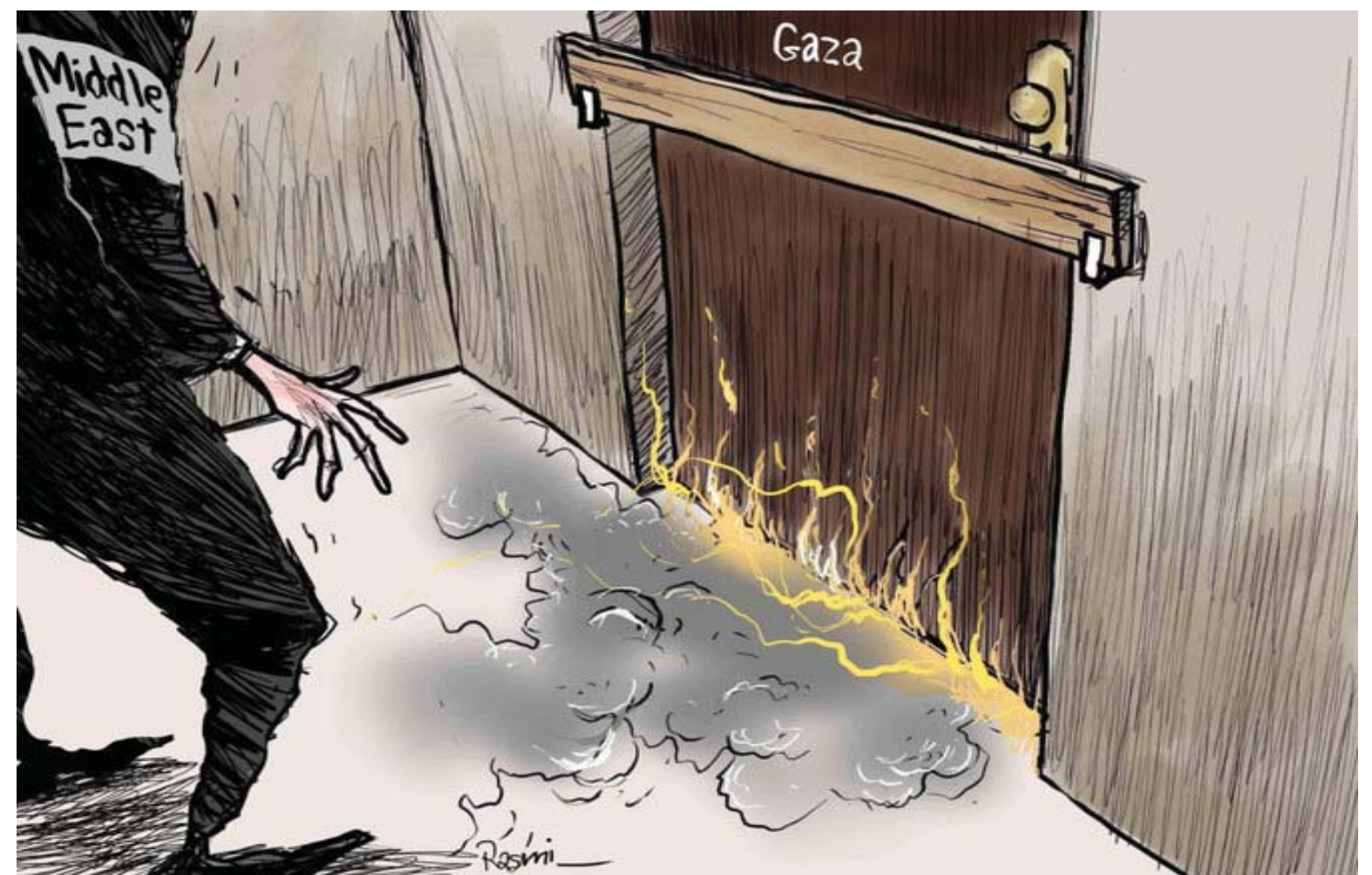
Cartoon by Amjad Rasmi. (Courtesy of Asharq Al-Awsat)