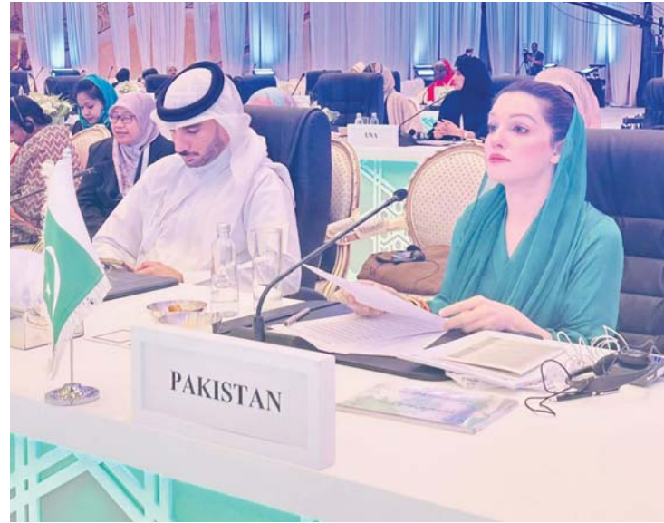
Where is Mohammad Yasin Malik," she asked, adding that a child deprived of