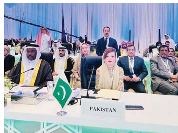
State, Ministers, and representatives from various international and regional organizations are participating.

The three-day Conference that runs between 6-8 November 2023 is aimed at holding broad-based discussions on the role of women in an Islamic society. It would focus on the rights and responsibilities of women in Islam. In addition to Islamic scholars and official delegations from the OIC Member States, a large number of female heads of