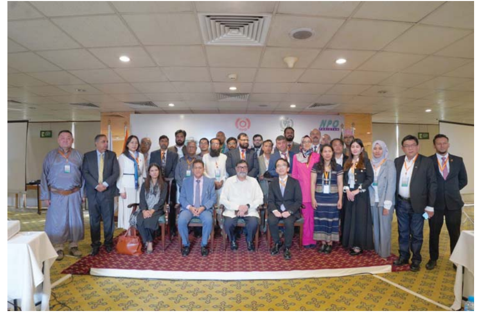
ventions, investment by offering several direct and indirect assistance programs.

He said with an estimated 48 million hectares of arable land, there exists a sizeable potential for improving efficiencies, yield, and productivity of the agriculture sector with better farm equipment and machinery. The Government of Pakistan is committed to support this sector, with the hope that the country can increase yields and exports of primary crops, fruit and vegetables, poultry, and dairy products—and in doing so become an important supplier for the region. To achieve this objective, the government is encouraging increasing private-sector inter-