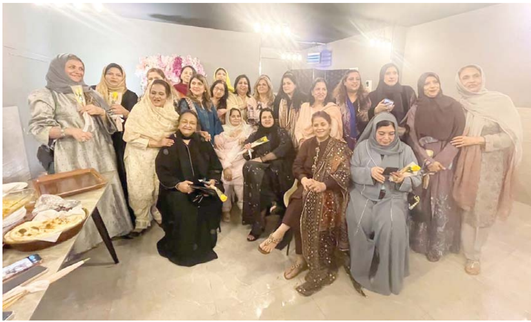
management said that we are serving the Pakistani community in Jeddah Saudi Arabia by spreading an aroma of Pakistani cuisine and at the same time contributing to the stability of the Pakistani economy, we have paid special attention to the menu along with quality and fresh ingredients. Along with Pakistanis, our indigenous delicious dishes are being liked

in other communities and the local Arab community here and we have also decorated the restaurant in a very unique way keeping in mind the passion of our community, which is becoming very popular.