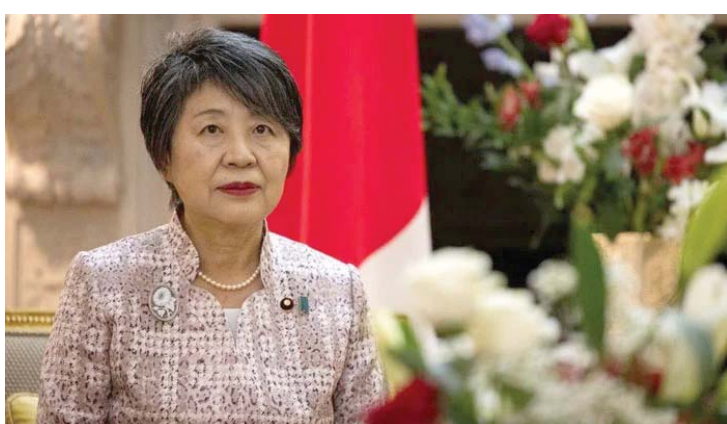
ing aid," Kamikawa said of her meeting with her Palestinian counterparts with-

"I hope to discuss how to respond to the grave humanitarian situation in the Gaza region as well as directly communicate Japan's readiness to continue provid-