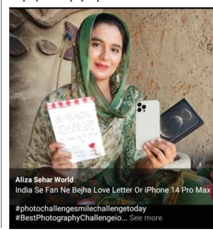
Aliza Sehar World India Se Fan Ne Bejha Love Letter Or iPhone 14 Pro Max #photochallenge#millechallengestoday #BestPhotographyChallenge... See more