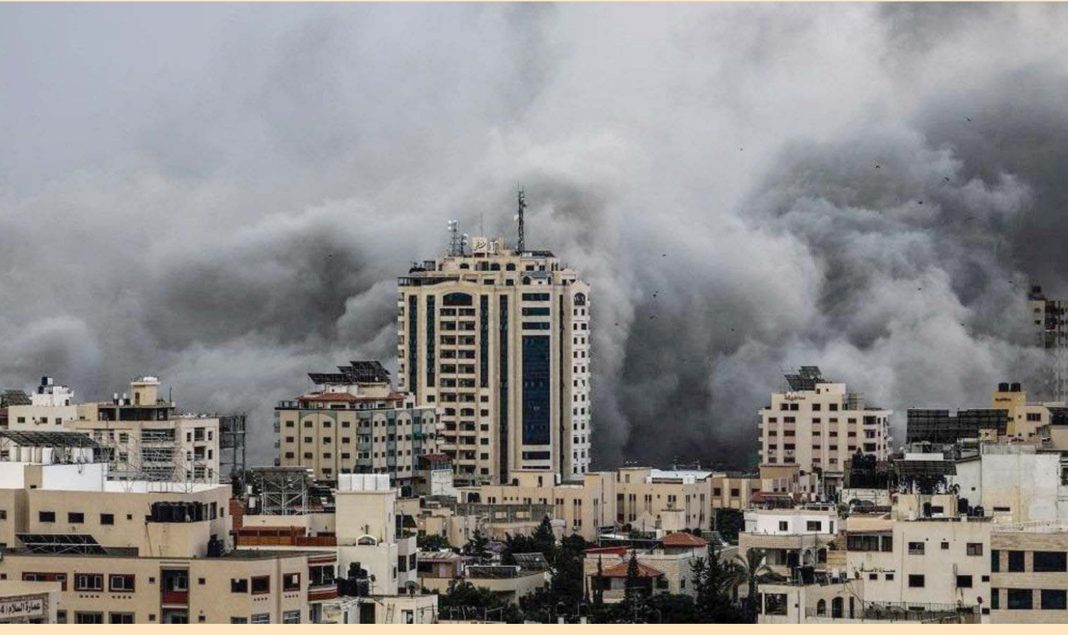
GAZA: Smoke billows following an Israeli air strike on Gaza City