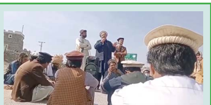
Political alliance staged protested in Wana for release ANP leader.