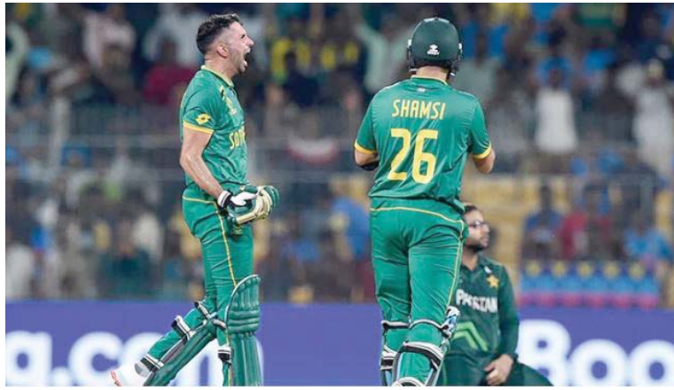
South Africa's Keshav Maharaj and Tabraiz Shamsi celebrate after South Africa win the match by 1 wicket.

Earlier, Pakistan were bowled out for 270 in 46.4 overs. Tabraiz Shamsi bagged figures of 4/60 while Marco Jansen