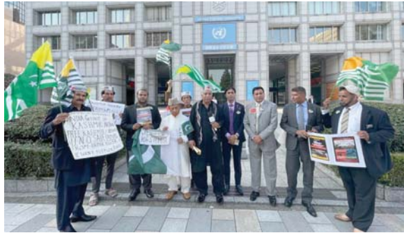
TOKYO: Members of the Pakistani community and Kashmiri Diaspora marched towards the UN Office in Tokyo and submitted a demarche.

TOKYO: An event was organized by Embassy of Pakistan, Tokyo to observe 27th October as Kashmir Black Day. Pakistani community members, Kashmiri diaspora as well as Japanese media persons attended. Messages of the President, Prime Minister and Foreign Minister of Pakistan, which emphasized on support and solidarity with Kashmiri people for realization of their legitimate right to self-determination were read out.