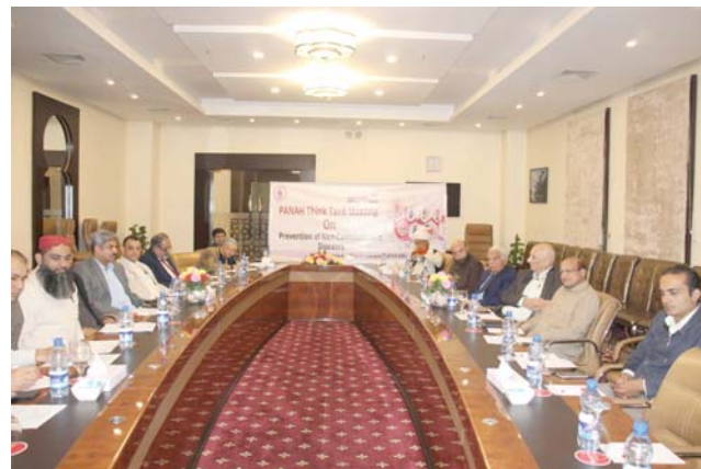
diseases. This think tank comprising experts from health professionals, civil society, media and