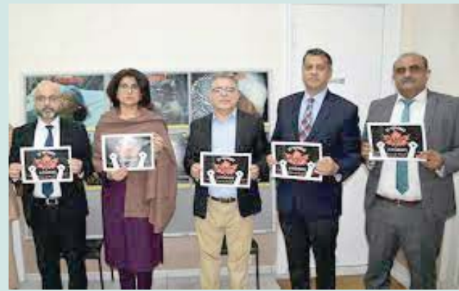
Photo exhibition to highlight Kashmir's plight inaugurated at Pakistan embassy in Brussels

Senior diplomats, officials, teachers, media and members of the community were present.