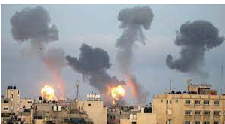
a new aid convoy entered Gaza from Egypt on Monday through the Rafah border crossing. This was the third such delivery after the crossing opened on Saturday for the first time since the start

of the conflict, following intense diplomatic efforts. A total of 34 trucks with aid provided by the UN and the Egyptian Red Crescent entered the enclave over the weekend.