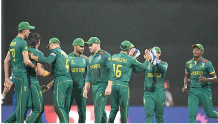
South Africa's players celebrate after the dismissal of England's captain Jos Buttler during the 2023 ICC Men's Cricket World Cup between England and South Africa at the Wankhede Stadium in Mumbai on Saturday.

England were on their way to suffering a 300-run defeat but a valiant effort by their tailenders, Gus Atkinson and Mark Wood, saved them as both batters built a 70-run partnership with the latter scoring an unbeaten 43 runs on 17 deliveries.