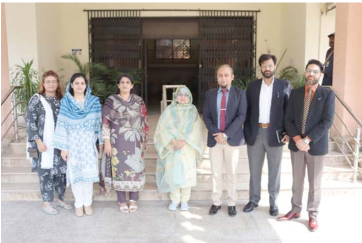
The participants, including the mentioned individuals, emphasized core areas of focus, including improving women's access to economic opportunities, enhancing girls' access to education, bolstering maternal and child health, combating gender-based violence, and increasing women's political and civic participation in Pakistan. Collaborative efforts and research were underscored as crucial mechanisms for achieving these goals, with the support of organizations like USAID and NSRP. WUM and its partner institutions, particularly FJWU, are committed to developing and implementing initiatives that advance gender equality and female empowerment, making the Consortium Conference 2024 a catalyst for meaningful change.

The central theme of the meeting was to explore innovative approaches that move beyond traditional academic presentations, focusing on practical solutions and impactful projects that can be showcased at the upcoming Consortium Conference in 2024.