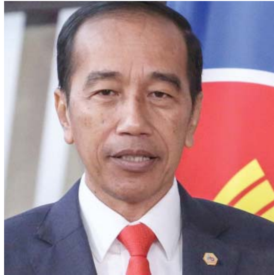
H.E. Mr. Joko Widodo President of the Republic of Indonesia

The implementation of TEI in 2022 recorded transactions of 15.83 billion US dollars. The five countries with the highest transaction value were China (10.78 billion dollars), India (1.51 billion dollars), Japan (843.96 million dollars), Egypt (492.04 million