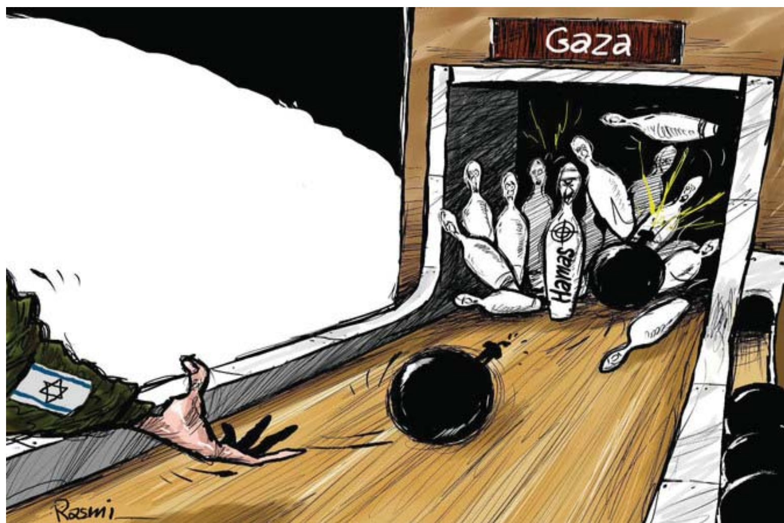
Cartoon by Amjad Rasmi. (Courtesy of Ashraf Al-Azcat)