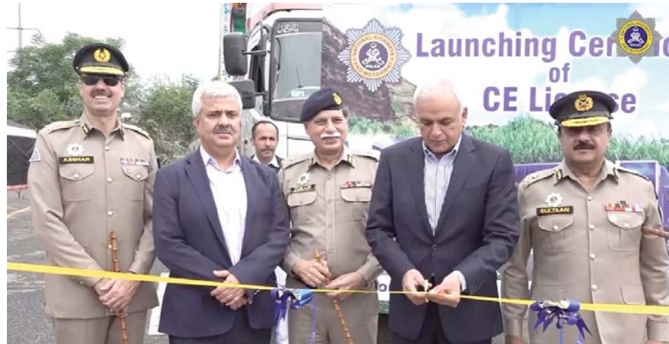
Police, and it is hoped that it will help to reduce traffic accidents and make the roads safer. It is also a positive development for the Pakistani economy, as it will open up new employ-

The launch of the CE category driving license is a commendable step by the Motorway