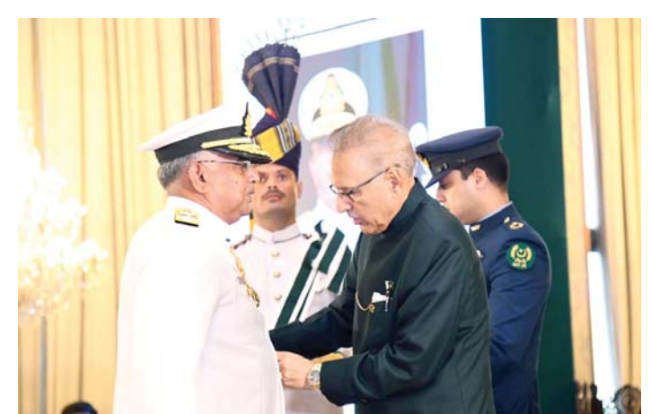
ISLAMABAD: President Dr Arif Alvi conferring the award of Nishan-e-Imtiaz (Military) upon the Chief of Naval Staff, Admiral Naveed Ashraf, at a special investiture ceremony held at Aiwan-e-Sadr, on Friday.

ministry said on social media platform X. Both sides expressed their commitment to promote mutual growth and prosperity in the global financial landscape.