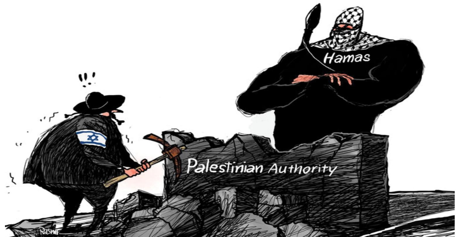
Cartoon by Amjad Rasmī. (Courtesy of Ashraf Al-Awsat)

He called on relevant parties to exercise restraint, de-escalate the situation on the ground as soon as possible, and prevent the fighting from further spreading.