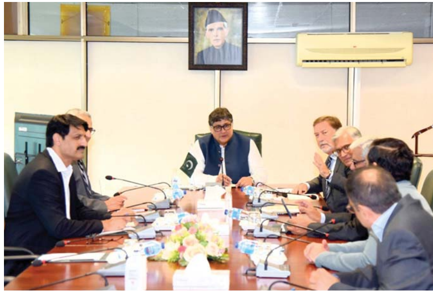
he was actively engaged in discussions with the Minister of Energy to create a structured time-line for the divestment of DISCOs, beginning with concession agreements. Both ministers

The Minister of Privatisation conveyed that