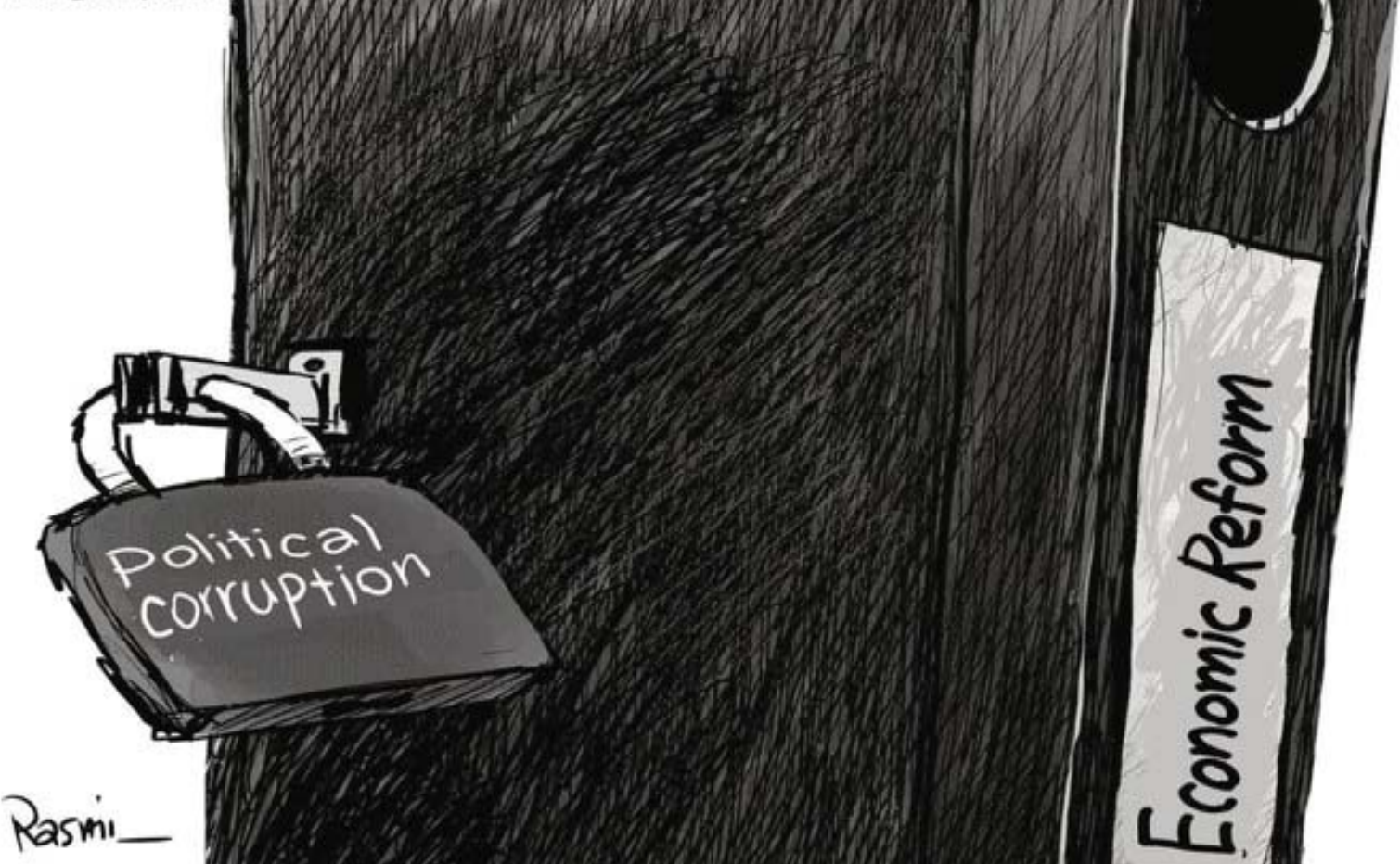
Cartoon by Amjad Rasmi. (Courtesy of Ashfaq Al-Awsat)