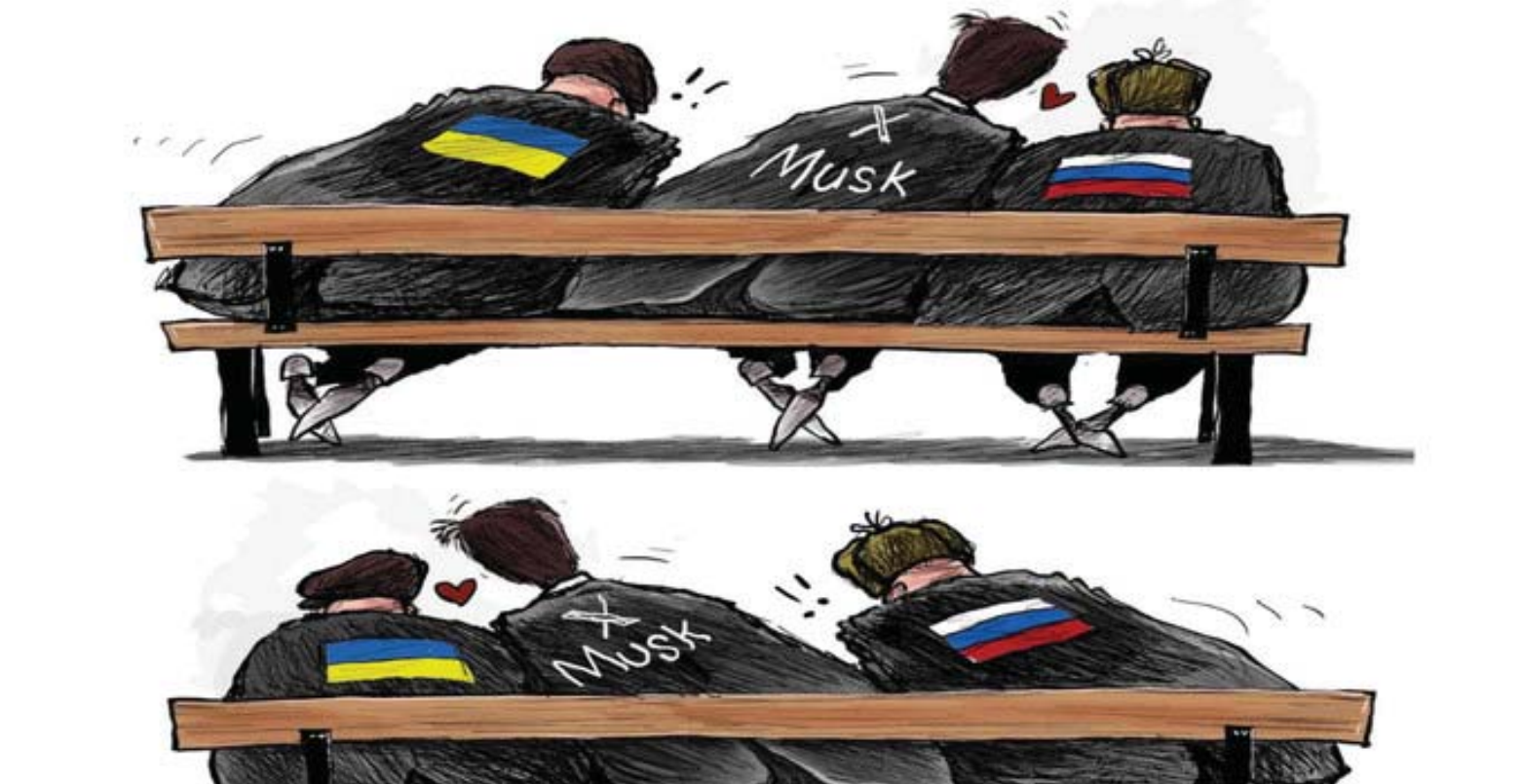
Cartoon by Amjad Rasmī.