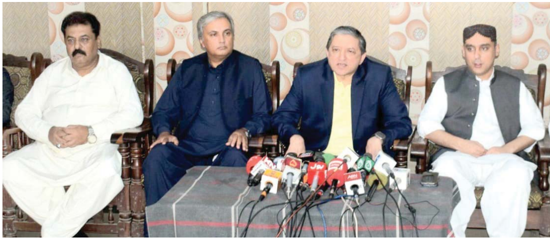
coming to Pakistan, I don't know, but the Charter of Economy is beneficial for everyone, which everyone should

In response to a question, he said that what is Nawaz Sharif's plan after