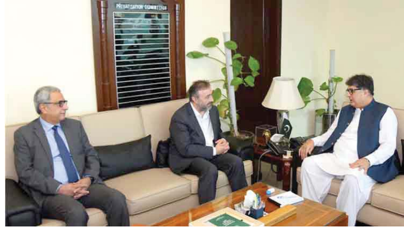
The minister expressed the government's intention to engage the WB and other financial institutions in the initial phases of privatising the national carrier. Fawad highlighted the intention to develop a comprehensive model for PIA, with the WB remaining a key partner for potential future support.

He said that concerted efforts aimed to rectify substantial financial losses incurred by these entities and thereby alleviate the fiscal burden on national exchequer.