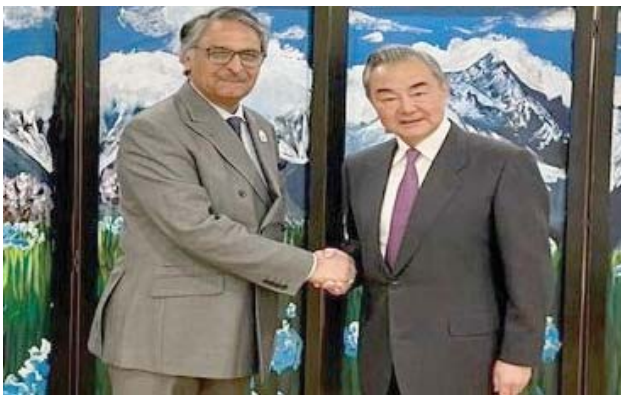
Trans-Himalaya Forum for International Cooperation held in Nyingchi, southwest China's Xizang (Tibet) Autonomous Region, CGTN reported.

BELJING: China and Pakistan are all-weather strategic cooperative partners and ironclad brothers, senior Chinese diplomat Wang Yi said on Thursday, adding that bilateral relations have withstood the test of time and continued to maintain a sound momentum of development.