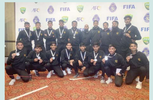
PFF commends U19 Football Team for historic achievement

The training of 14 games including swimming, athletics, archery, badminton, cricket, karate, taekwondo, tennis, wushu and self-defence will be imparted at Nishtar Park Sports Complex while the training of five indoor games including table tennis, badminton, karate, taekwondo and gymnastic will be given at district level under the supervision of qualified coaches.