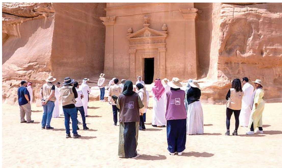
Hawsawi highlighted the project's aim of preserving cultural heritage and having it listed in the national register

as a step toward potential inclusion in UNESCO's World Heritage List.