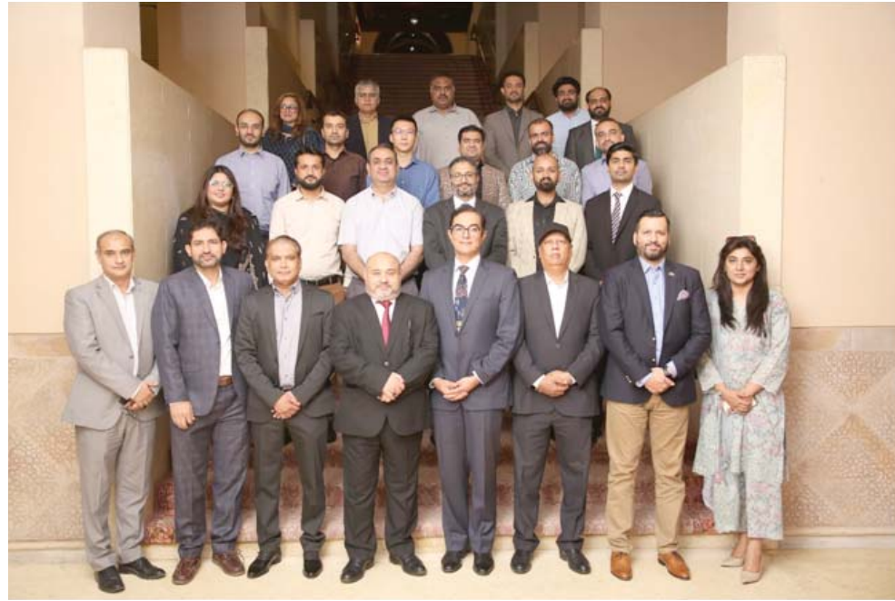
Pakistan which is held annually and attracts over 1200 delegates from local and international E&P Companies, Services Companies, Regulatory Authorities and academia who bring and share their experience along with 35 stalls where global exhibitors display their technology.

Society of Petroleum Engineers (SPE) Pakistan Section and Pakistan Association of Petroleum Geoscientists (PAPG) are holding Annual Technical Conference (ATC) and Exhibition on 7th and 8th November 2023 at the Serena Hotel, Islamabad. The theme of this year's conference is "Exploring the Unexplored: High Risk Plays and Economic Challenges". ATC is a mega event of Petroleum Industry of