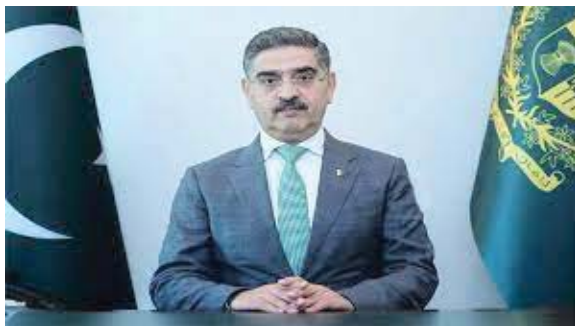
Lord Zameer Choudhry at the House of Lords, PM Office Media Wing said in a press release.

LONDON: Caretaker Prime Minister Anwaar-ul-Haq Kakar Tuesday commended the dynamic British Pakistani diaspora for their significant contributions to both countries' development and urged them to consider the Special Investment Facilitation Council (SIFC) as a valuable platform for investments in key sectors.