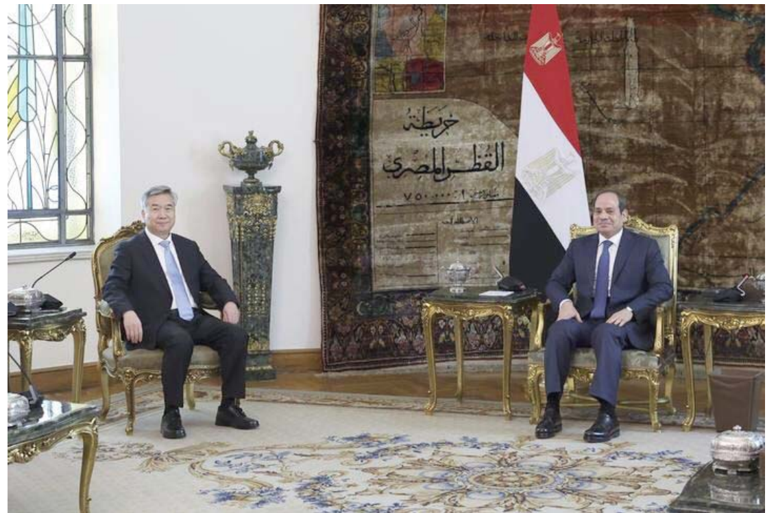
Future Party attaches great importance to exchanges with the CPC and hopes to strengthen exchanges and mutual learning in cadre training,