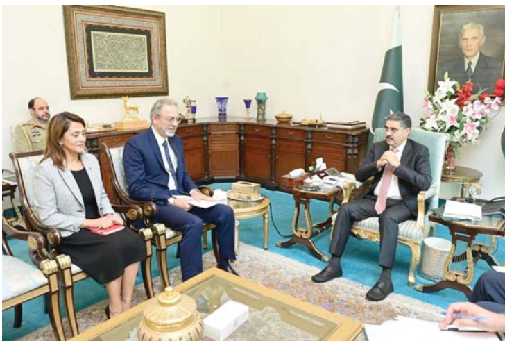
ness to continue extending all possible support to the Turkish people.

The Prime Minister appreciated Turkiye's reconstruction efforts following the tragic earthquake of February 2023 and reiterated Pakistan's readi-