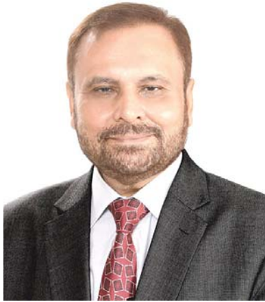
availability of sugar are gradually becoming stable.

He supported the massive crackdown and showed 'zero tolerance' towards smuggling and hoarding of essential commodities, due to which the price and