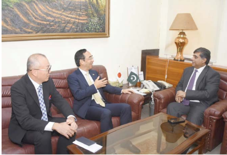
sentiment of collaboration and highlighted the need to formulate a comprehensive road-map for expanding exports to Japan. This road-map will serve as a strategic guide to strength-

en economic ties and facilitate smoother trade between the two nations.