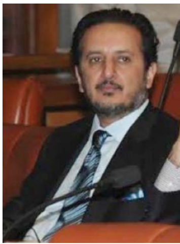
Civil Divisions and Superintending Engineers and Executive Engineers

Teams headed by Commissioners, Deputy Commissioners of the four