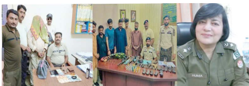
app, and 168439 vehicles were checked.

Keeping highways crime free is my top priority and violators of law and order are being dealt with strictly. 351776 persons were checked through police