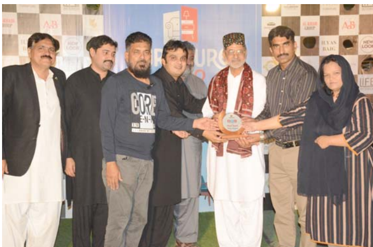
furniture at reasonable prices. He said that the exhibition broke all the

More than 50 companies from all over the country are setting up their stalls in the exhibition. Justice Malik Manzoor Hussain said that the organization of the furniture exhibition is welcome, people are getting the best