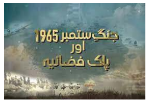
air battle fought on the day of 3rd September, 1965.

ISLAMABAD: The Directorate General Public Relations (Air Force) has released a short documentary to highlight the valour and professionalism of the brave sons of the nation in the September 1965 war. The documentary showcases the