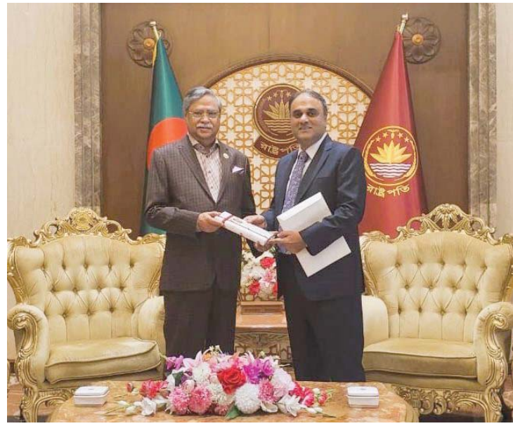
Dr. Arif Alvi during the meeting.

The President appreciated the efforts of the High Commissioner for strengthening relations between the two countries and congratulated him on successful completion of his term in Bangladesh. The Honourable President reciprocated the greetings conveyed by the High Commissioner on behalf of the President of Pakistan