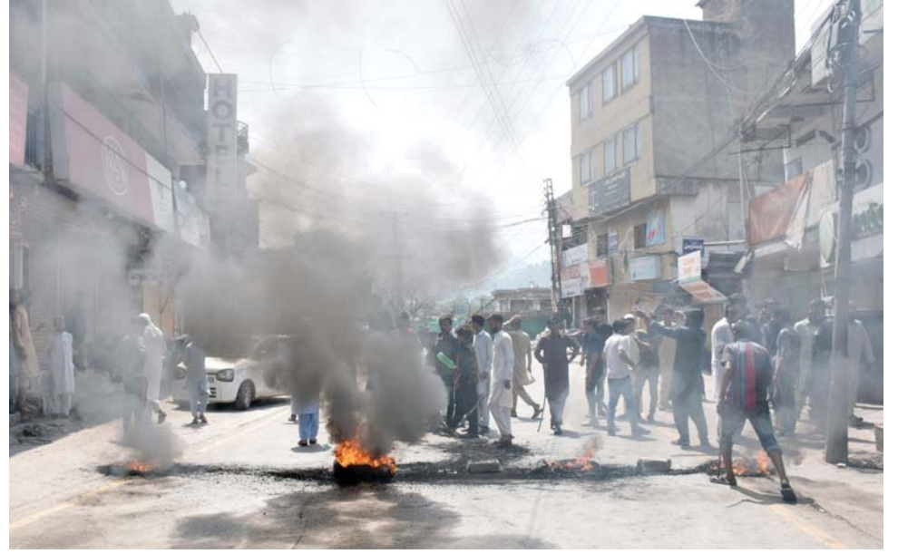
and come up with a solid plan of action to resolve this issue without further delay.

The PM said that the caretaker government must pay heed to the voice of the people of Azad Kash-