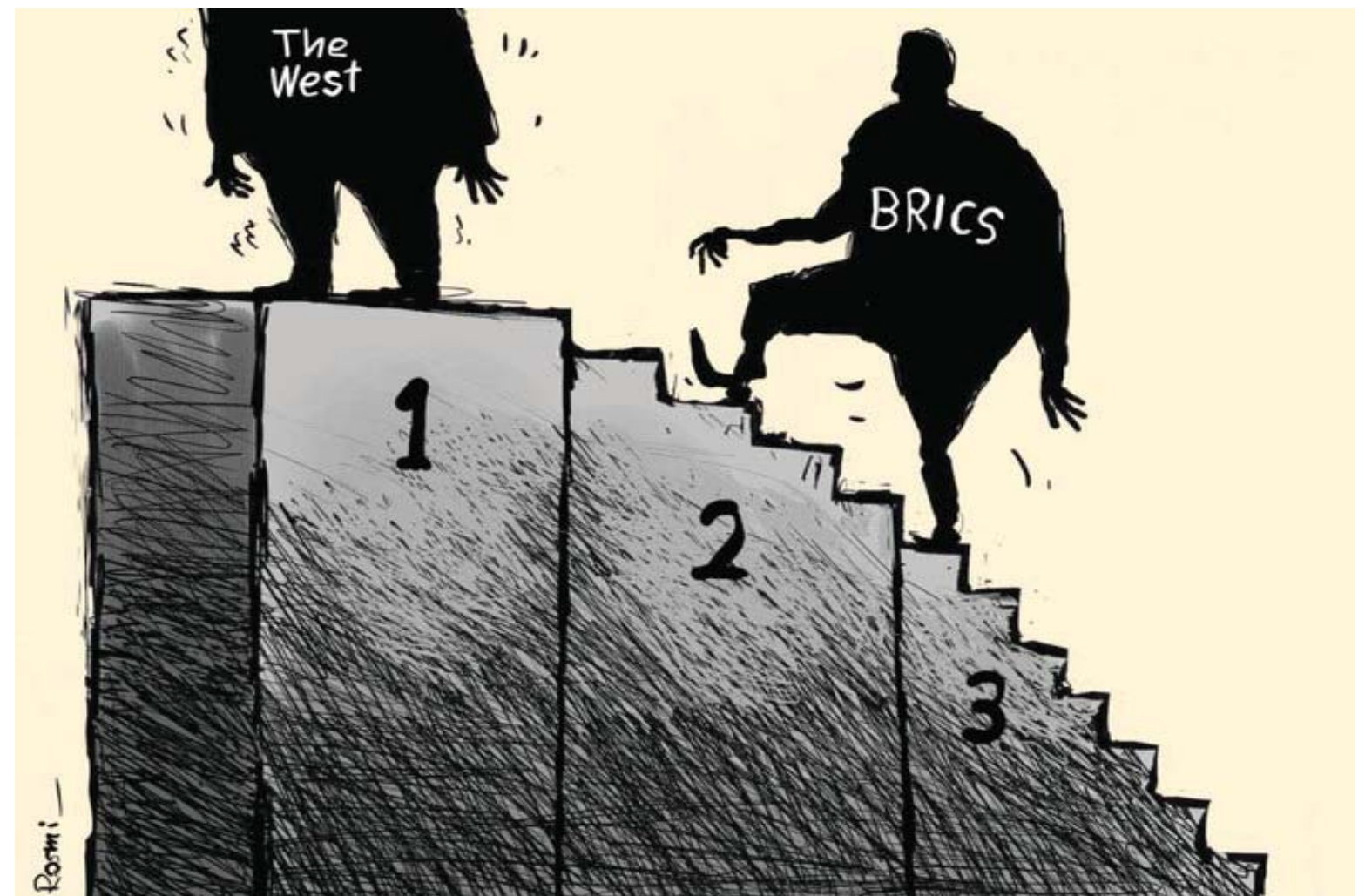
Cartoon by Amjad Rasmī. (Courtesy of Ashfaq Al-Awsat)