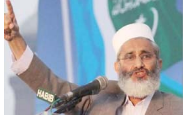
nation can hold them accountable with the power of vote.

up against inflation and oppression, the path of looters must be blocked through peaceful democratic struggle. On September 1, youth will gather in Liaquat Bagh Rawalpindi against the increase in electricity prices. India has reached the moon, the majority of us do not even have access to clean water to drink, the storm of unrest, inflation and unemployment continues, atrocities are being done on girls. The oppressive feudal lords, vaders and corrupt capitalists made wealth for themselves by staying in power, built properties abroad and made the country and the nation beggars. There is no lack of resources in the country, the problem is incompetent and corrupt rulers. NAB, courts and other accountability institutions have failed to hold accountable the corrupt ruling group, now the