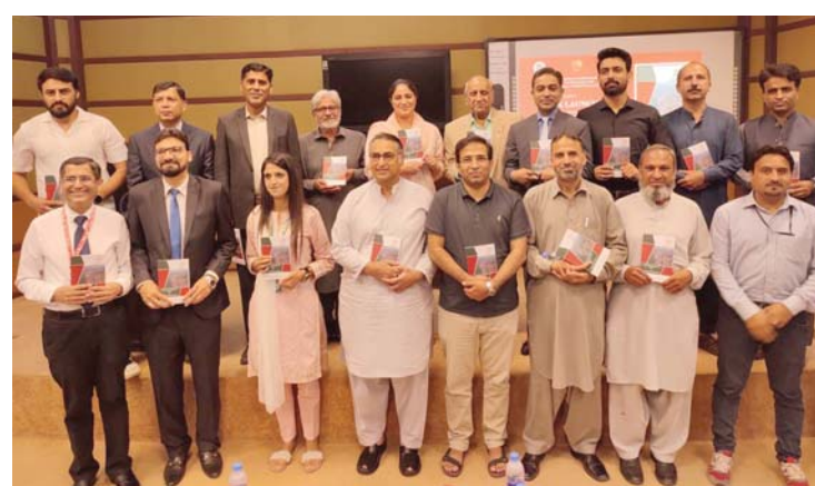
ven tales of CPEC's impact. Professionals, diplomats, and experts converged

to communities and businesses intricately woven into the fabric of this transformative project, the Islamabad Institute of Conflict Resolution aims to furnish its readers with a profound and nuanced comprehension of the multifaceted impacts of CPEC on an array of sectors. These sectors encompass not only the tangible dimensions like infrastructure development, energy, agriculture, and education but also extend to the intangible realms of cultural exchanges, tourism, and socio-economic growth. The book launch event served as a gathering ground for luminaries from various walks of life, who were drawn by the shared intrigue in the inter-