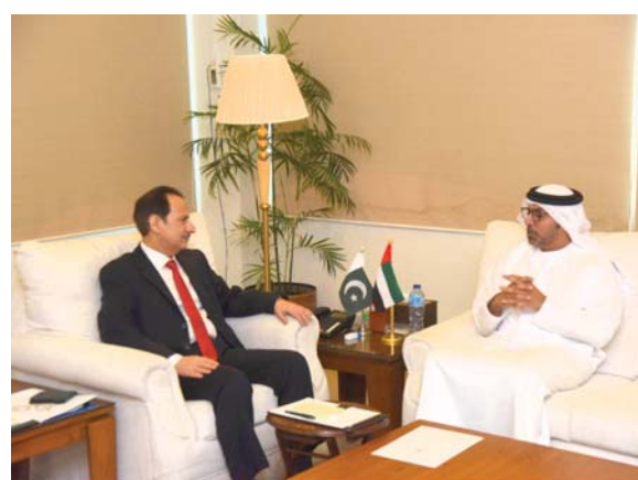
job on his appointment as the country's health minister.

During meeting with the minister, the ambassador lauded the Government of Pakistan's approach of assigning the right man for right