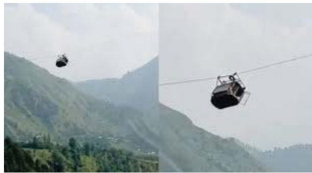
Pashto area broke on Tuesday.

Earlier, a Pakistan Army helicopter reached Battagram, Khyber Pakhtunkhwa, to rescue schoolchildren and teachers, who are stranded midair after the cable of a chairlift passing over a river broke in the Allai Jhangray