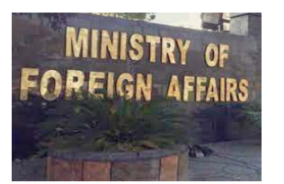
ing, reaffirmed in February 2021.

Emphasizing the need for maintaining peace and tranquillity at the LoC, it was underscored that such acts are in clear violation of the 2003 Ceasefire Understand-