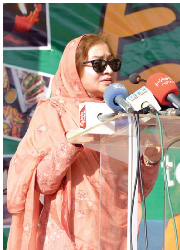
She has completed various National Projects in the field of Education as well as she has completed