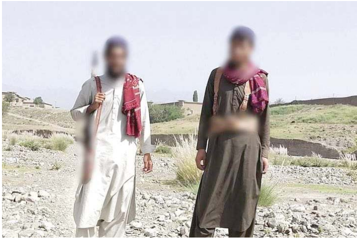
land in 2015 and again in 2017.

It should be noted that the conflict between the two tribes has been going on for a long time over the land of "Bala Pathatr" before that there were clashes between the two tribes on the same