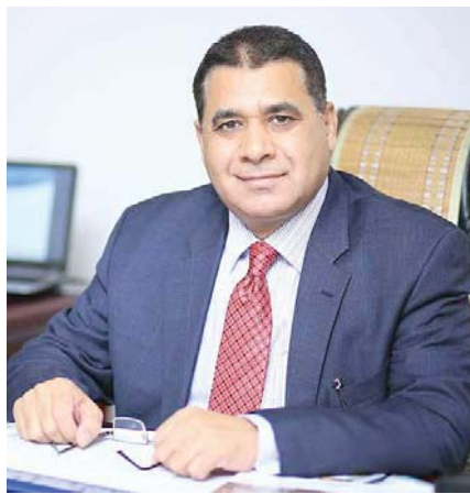
and growing takaful segment of the business.

ISLAMABAD: The United Insurance Company (UIC) continues to enjoy a stable outlook despite the overall decline in economic conditions in the country, which is an achievement. Pakistan Credit Rating Agency (PACRA) has maintained, while VIS Credit Rating Company has reaffirmed the Insurer Financial Strength (IFS) rating of United Insurance Company (UIC) at 'AA+' (Double A Plus). The rating signifies the strong capacity of the company to meet policyholders and contract obligations. Risk factors are very low, and the impact of any adverse business and economic factors is expected to be very small. UIC, being the group's flagship company, is a major player among the leading general insurers in the country and has an established