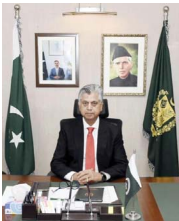
ISLAMABAD: Murtaza Solangi, assumed the charge as Caretaker Federal Minister for Information & Broadcasting.

Portfolios (Caretaker Ministers): Shamsah Akhtar (Minister for Finance, Privatisation) Ex-Foreign Secretary Jalil Abbas Jilani (Foreign Minister) Murtaza Solangi (Information and Broadcasting Minister) Sarfraz Bugti (Minister for Inte-