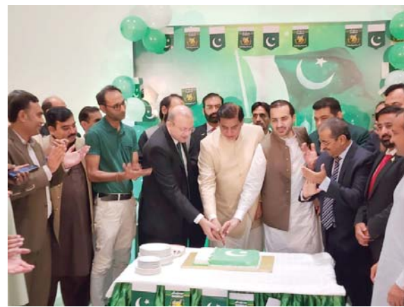
While highlighting the significance of democracy

ties, let us not forget about our brethren in IIOJK, who are imprisoned in an open jail from the past 4 years and stripped off their right to self-determination and right to freedom." He also resolved, "On this occasion lets pledge to add more vigour and intensity in our efforts to sensitize the International Community regarding the deprivation of basic human rights, especially self-determination and freedom, of our Kashmiri brethren by the Extremist and Fascist BJP led Government and RSS Ideology.