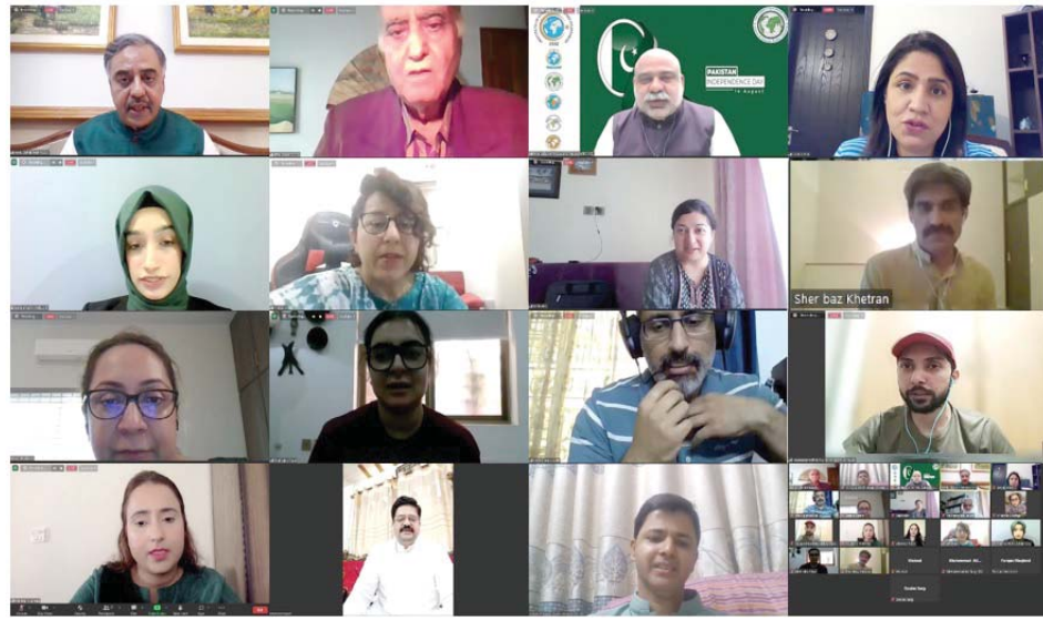
"Abiding commitment to Quaid's Vision is the best path forward for Pakistan" — ISSI's Web Celebration on Independence Day 2023

Amb Sohail Mahmood stressed that the key in this regard is an abiding commitment to the Quaid's vision of Pakistan as an economically strong, socially progressive, democratic, Islamic welfare state. "Peace Within, Peace Without" was a cardinal principle of Quaid's vision for Pakistan as a polity and nation-state. Faithful implementation of this vision would enable Pakistan to attain sustainable peace, progress and prosperity, he emphasised.