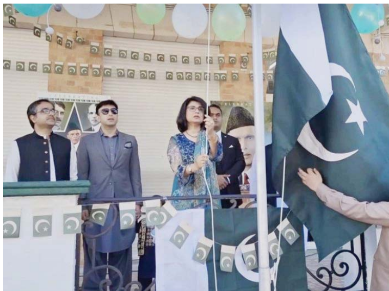
prosperous country. Independence Day celebrated at Pakistan embassy in Belgium