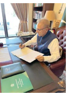
on the nomination of Senator Kakar and jointly signed the summary.

ISLAMABAD: President Dr Arif Alvi on Saturday signed a summary to approve the appointment of Anwaar-ul-Haq as the caretaker Prime Minister under Article 224(1A) of the Constitution, at Aiwan-e-Sadr.