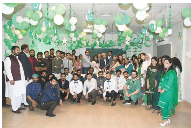
its founding fathers.