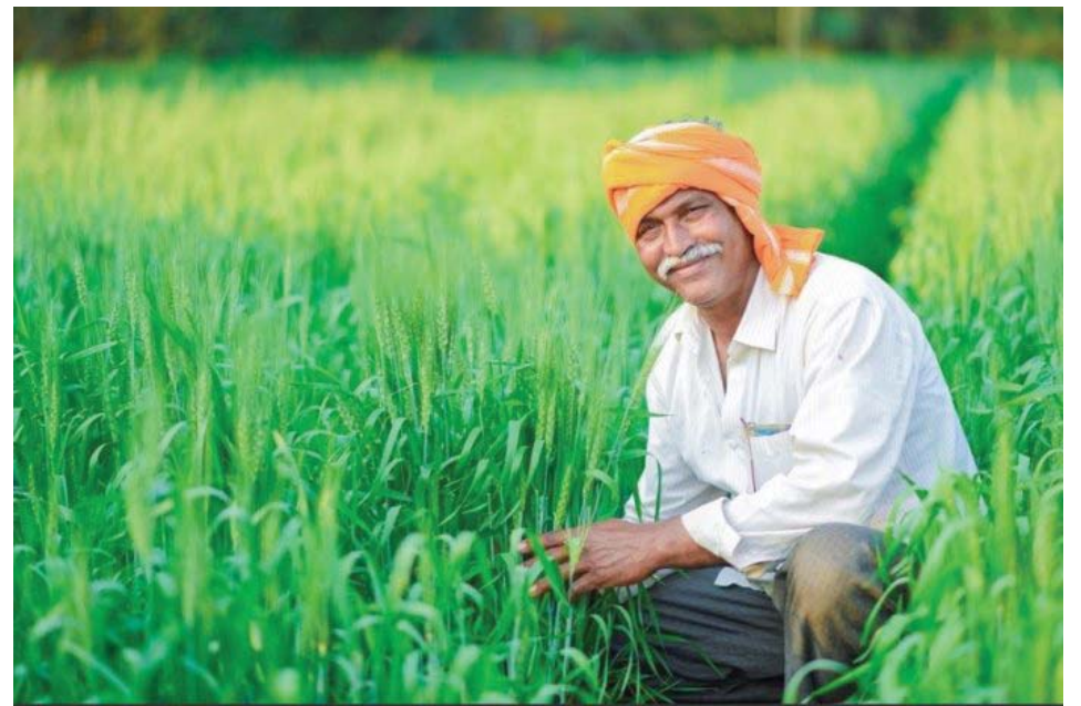
The official further said that recognizing the importance of farm mechanization, the government had provided Rs1,056 million to 507 farmers under the mark-up and risk scheme, he said adding that the initiative aimed to enhance productivity and efficiency in the agriculture sector.

"Moreover, the government disbursed Rs12,817 million under Prime Minister Youth Business and Agriculture Scheme to 23,857 farmers, which provides financial assistance and support to young farmers in agriculture entrepreneurship," he added.