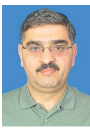
stans and Human Resource Development and as a member

ly signed the advice for the appointment of the caretaker PM and sent it to the President of Pakistan, it was added. On the occasion, the prime minister thanked the leader of the opposition for his role in the parliament during the last 16 months and the cooperation extended in the consultation process. Anwaarul Haq Kakar was elected as an independent senator from Balochistan province for a tenure of March 2018 to March 2024 in the general seat. He was also working as chairperson Senate Standing Committee on Overseas Paki-