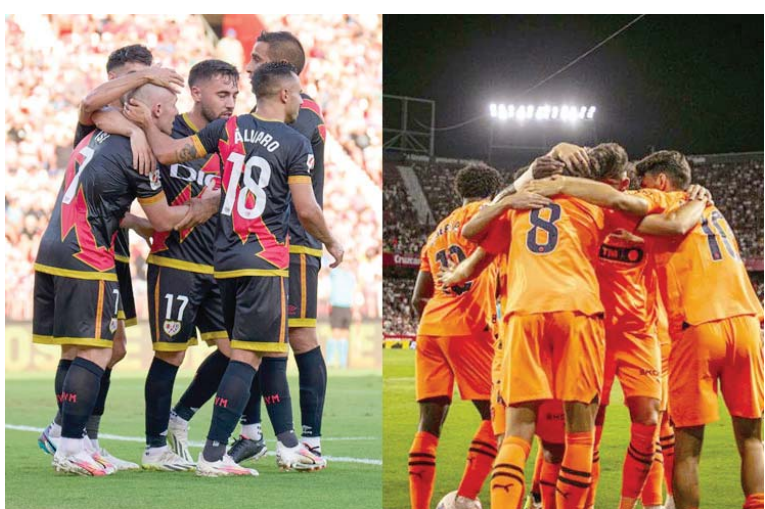
the far post from a well-calculated cross by Suso.

Valencia's lead however shortlived as Sevilla pulled one back nine minutes later, courtesy of Morocco's forward Youssef En-Nesyri, who headed in at