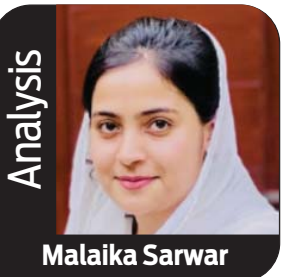
Analysis Malaika Sarwar

In the realm of addressing child abuse in Pakistan in terms of recent Rizwana’s torture case, the question persists: Does wealth truly triumph over justice? Sadly, the prevailing evidence suggests that economic influence continues to cast a shadow over the pursuit of justice for the most vulnerable members of society. As long as financial power affords individuals the means to manipulate legal processes, secure expert representation, and navigate the corridors of authority, the inherent promise of equal justice remains compromised. Until comprehensive reforms are enacted to ensure equitable access to justice, regardless of economic status, the threat of child abuse will persistently loom, casting doubt on the nation’s commitment to safeguarding its future generations.