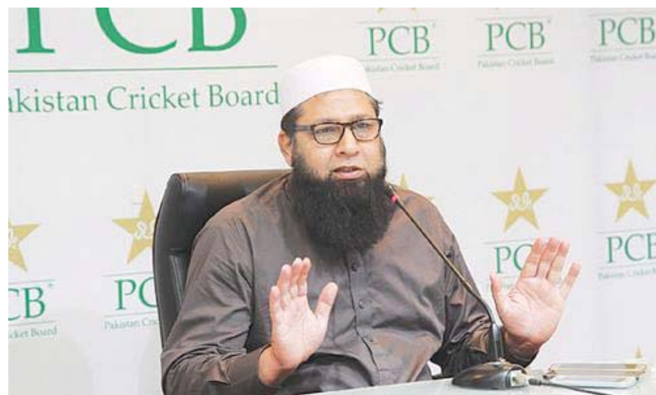
Azam. Players participating in Lank-