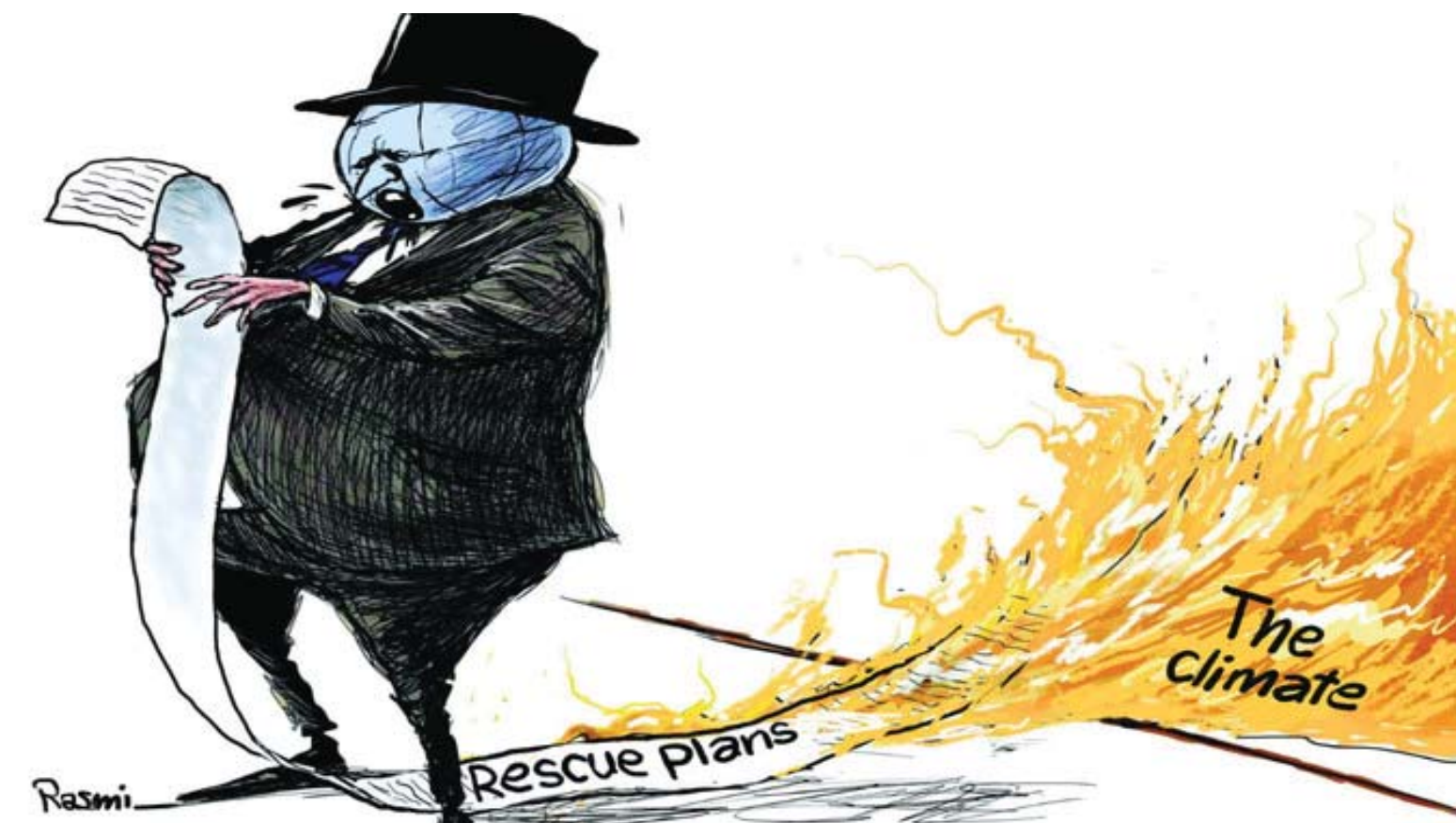
Cartoon by Amjad Rasmi. (Courtesy of Ashfaq Al-Awcat)

For the sake of prosperity, people have left the only option of working abroad as the state offers no such platform where they can work and uplift their social status. If the government wants to decrease the number of people going out of the country it should invest more and more to create better jobs for them so that they can live prosperous lives. Another reason which needs to be addressed on an urgent basis is the threat posed by militant groups. Irrespective of agreements between state and militant groups, there have seen many attacks in the province of KP and Balochistan. It is argued that these groups are being harbored under the flag of the Taliban regime. So security policy with the Taliban Government needs to be reviewed so that peace can prevail in the region. Deplorable situation among youth has prevailed due to political instability, which since the