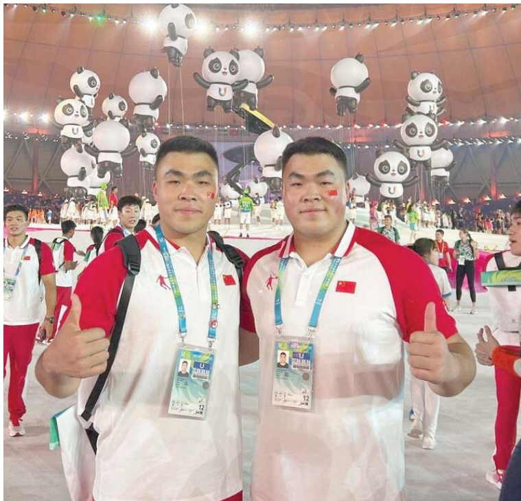
Their new life in Beijing was challenging, filled with long study hours from 7 a.m. to 3 p.m., followed by rigorous training at Beijing Sport University until 9 p.m..