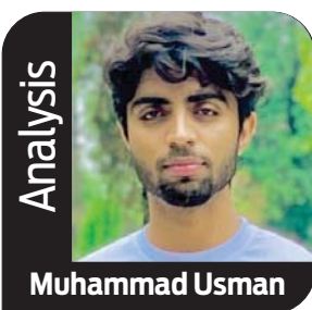
Analysis Muhammad Usman