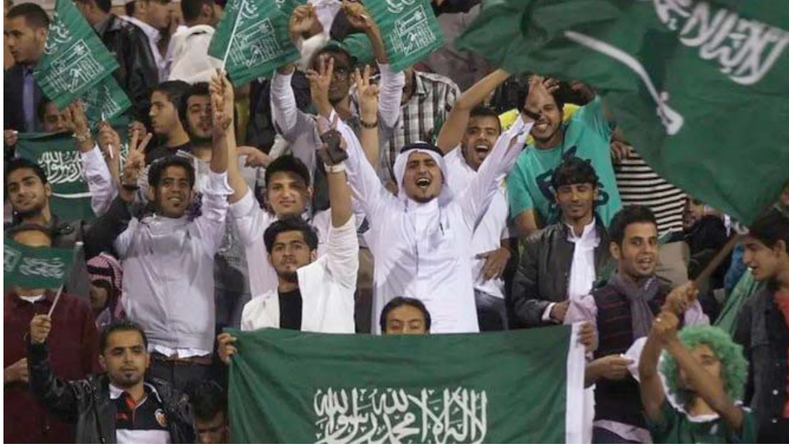
sector, all of which are contributing to a more vibrant society, in line with PIF's strategy and Saudi Vision 2030."