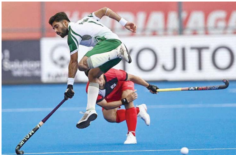
extended their dominance and took the lead with another goal.