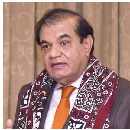
For the past forty years, whatever statements every government makes, its policies are made for the welfare of this limited class with unlim-