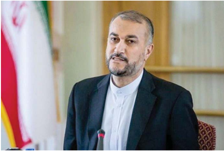
views on the consensus between the leadership of the two countries for taking this relationship forward. The Iranian foreign minister will

Foreign Minister Abdollahian will call on Prime Minister Muhammad Shehbaz Sharif for an exchange of